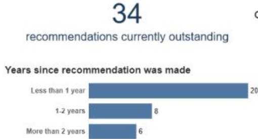
Outstanding Recommendation Distribution