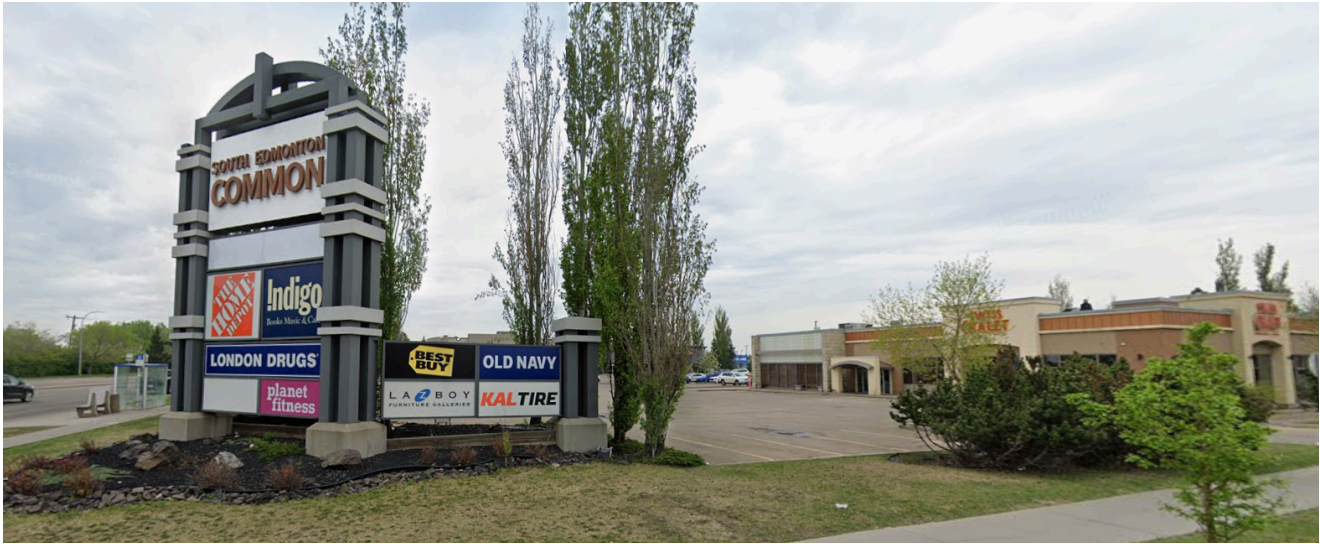
View of the site looking southeast from 23 Avenue NW and 99 Street NW