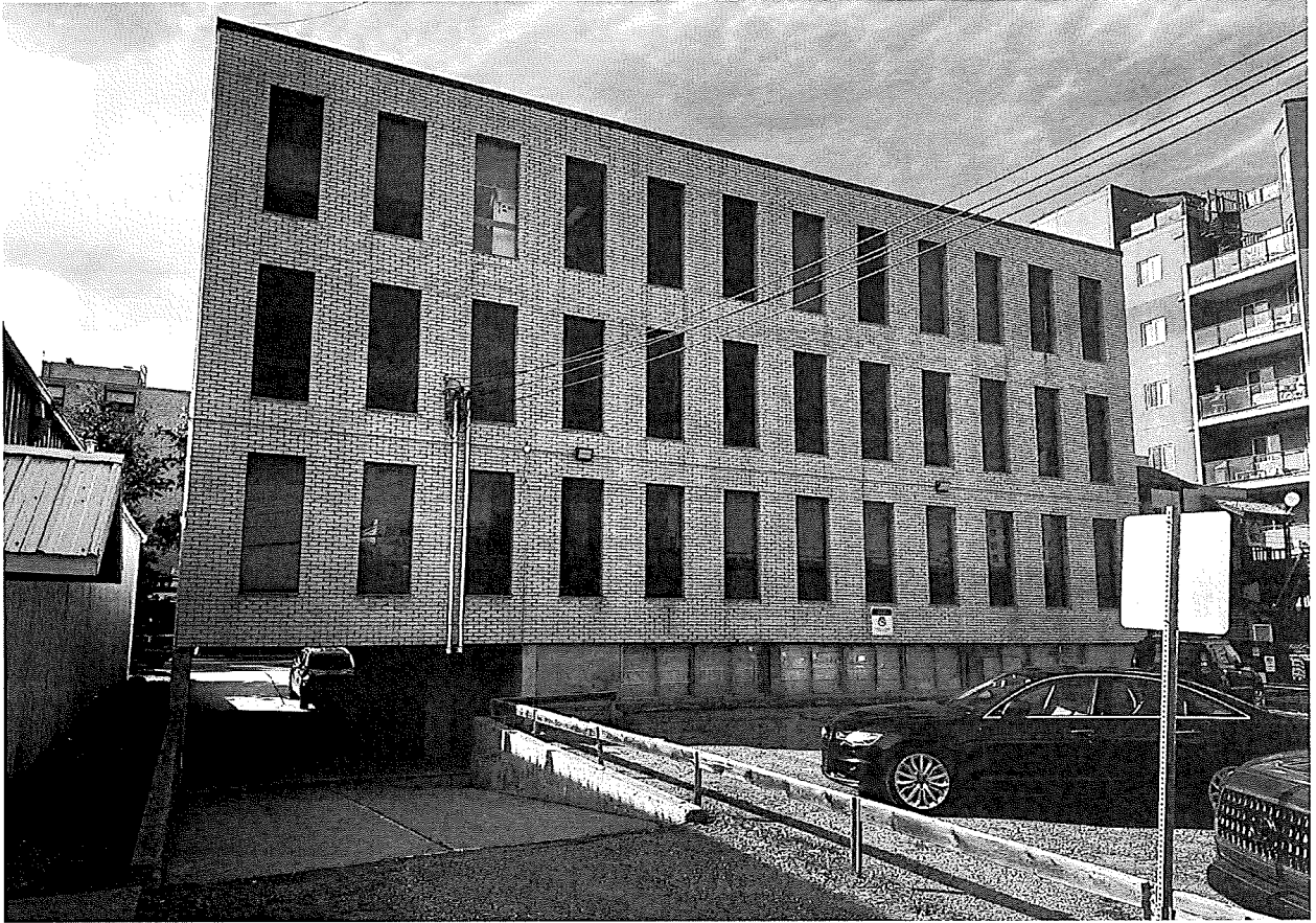
View of rear (east) elevation, with south driveway visible.