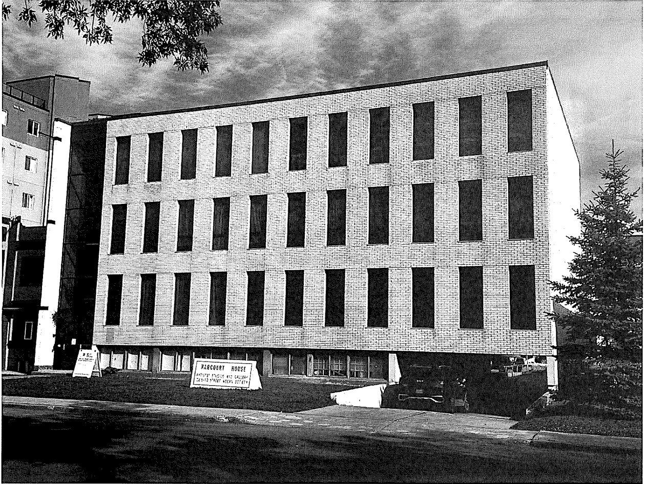
View of front (west) elevation, looking east from 112 Street NW.