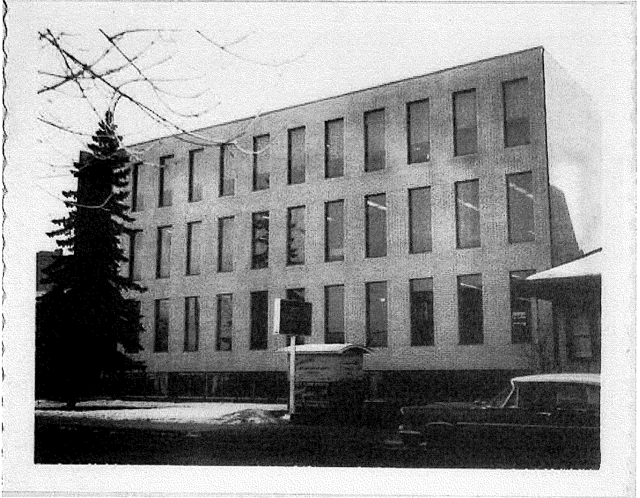
Front (west) elevation of the Harcourt House, circa 1968.