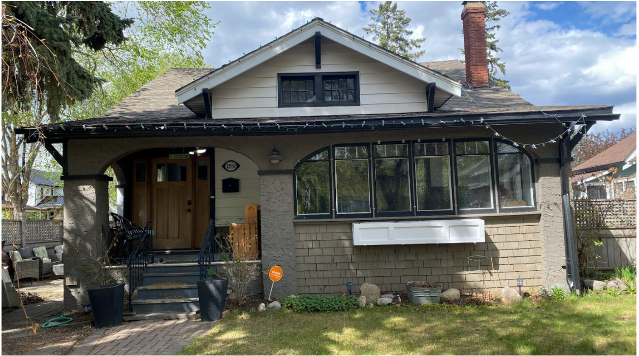
Front (south) elevation of the Wood Residence.