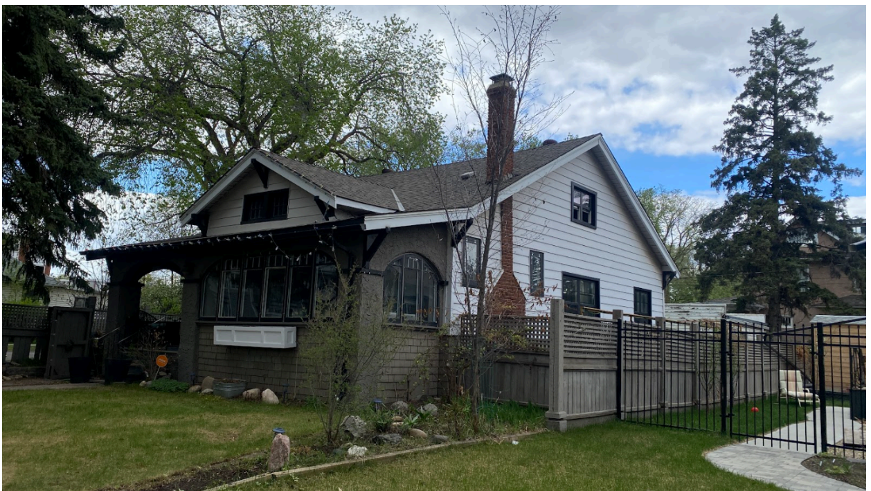
Front and side (east) elevation of the Wood Residence.