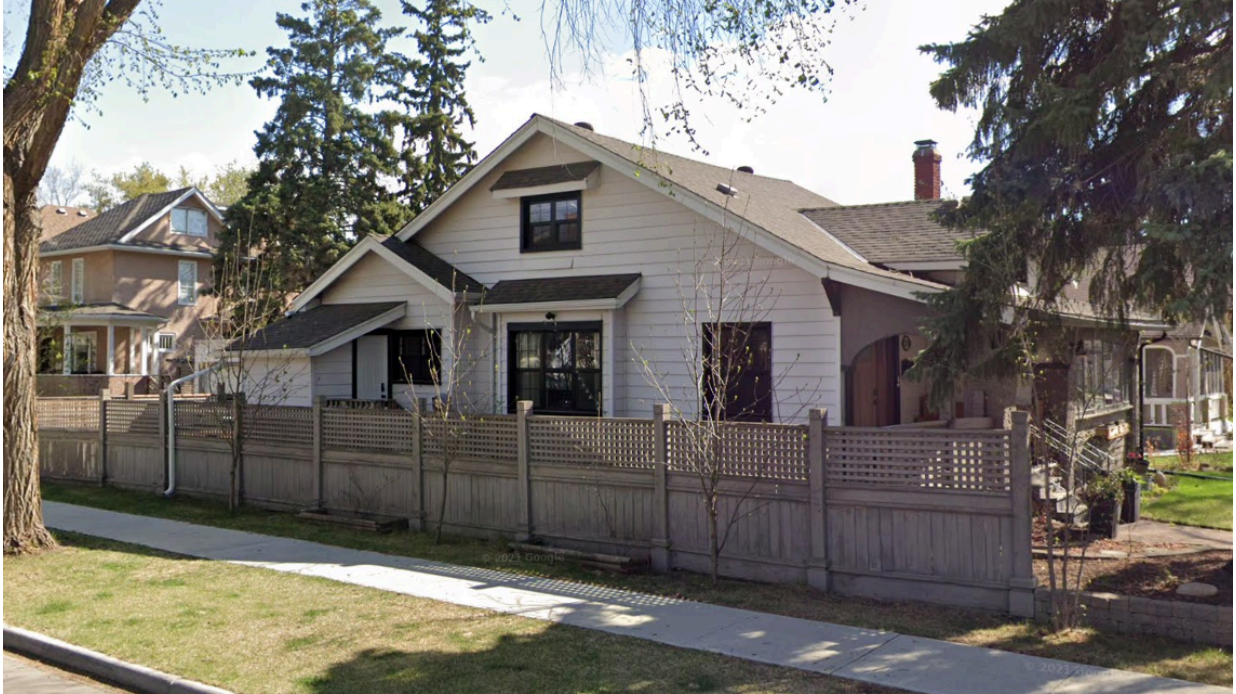
Side (west) elevation of the Wood Residence.