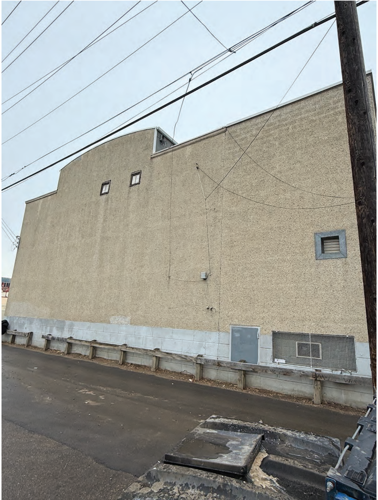
View of rear (east) elevation, looking west from rear alley.