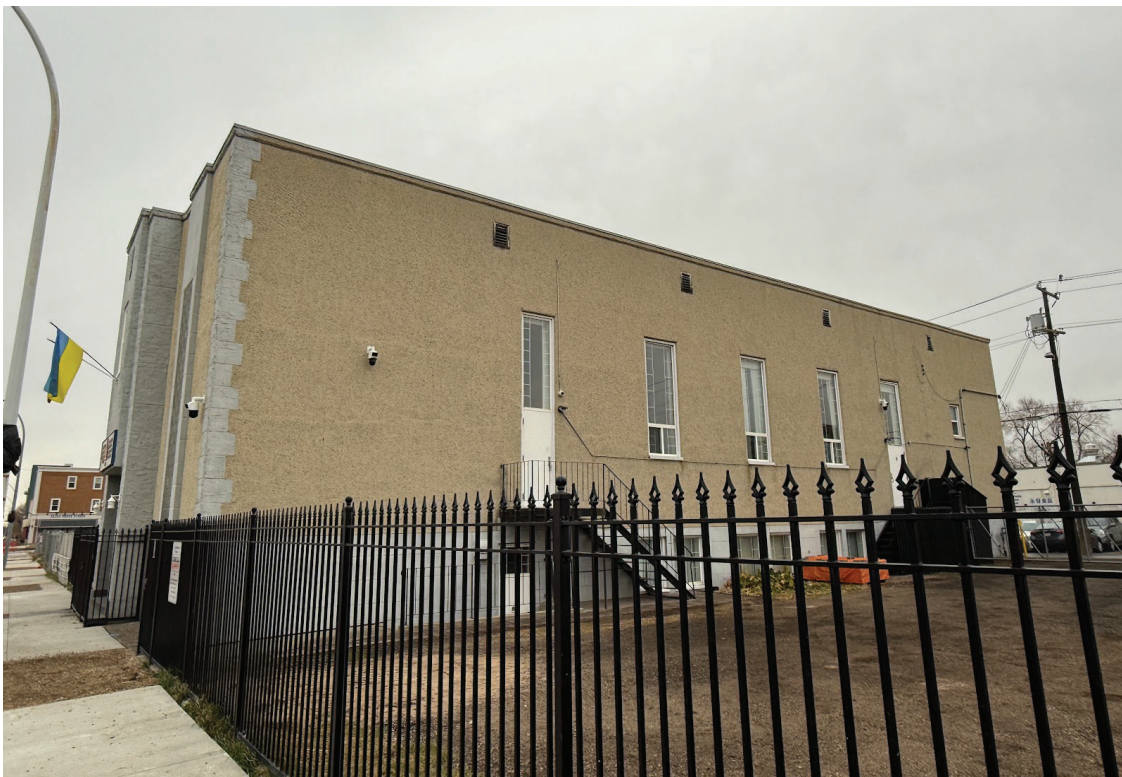
View of south elevation, looking north from 98 Street NW.