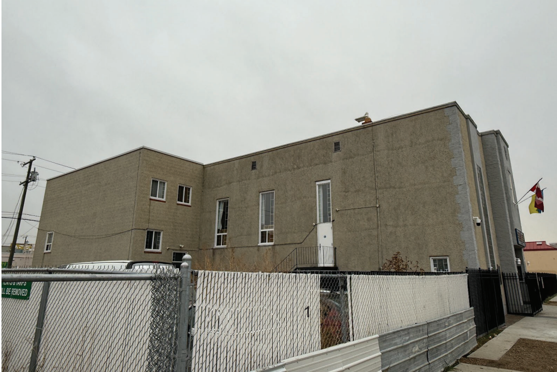
View of north elevation, looking south from 98 Street NW.