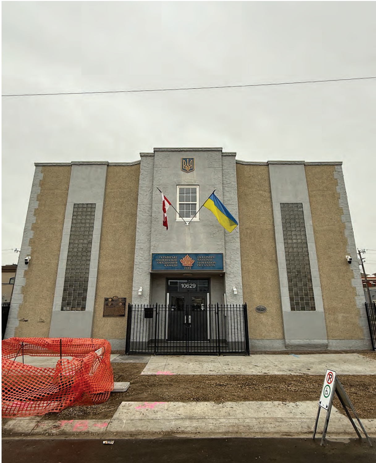
View of front (west) elevation, looking east from 98 Street NW.