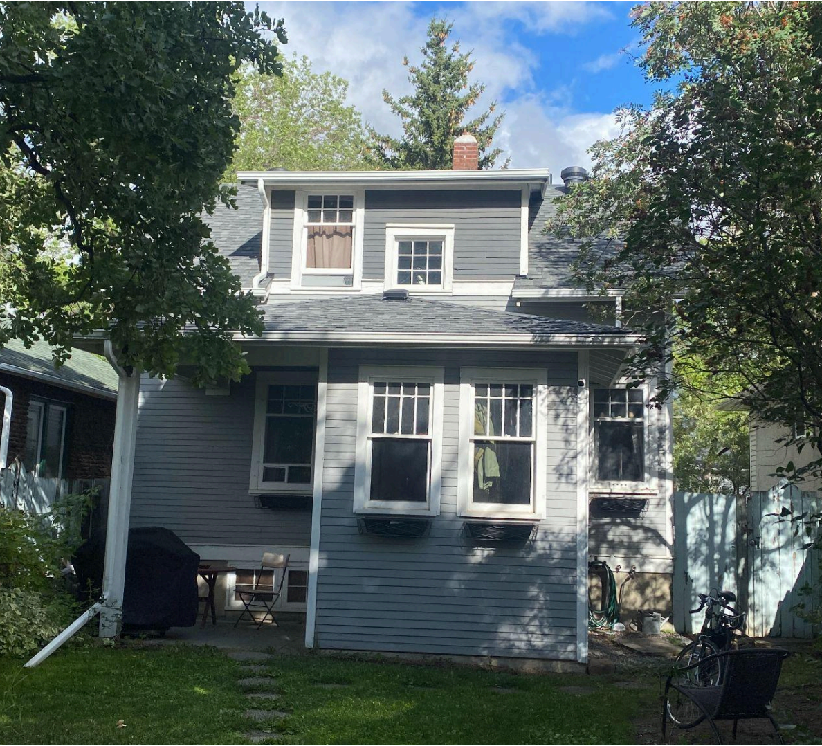
Rear (west) elevation of the Barker/Myren Residence. The rear contains an enclosed porch addition from 2006, which is not part of the designation.