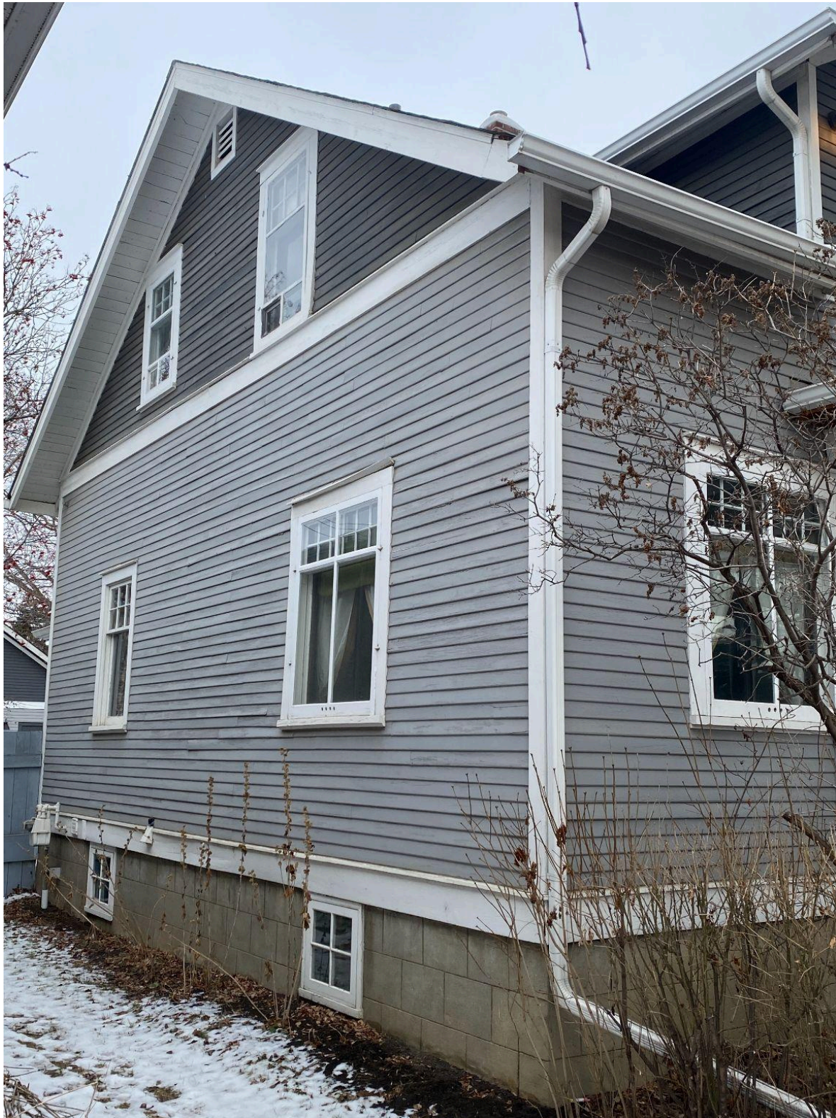
View of side (south) elevation of the Barker/Myren Residence, as viewed from the front of the property.