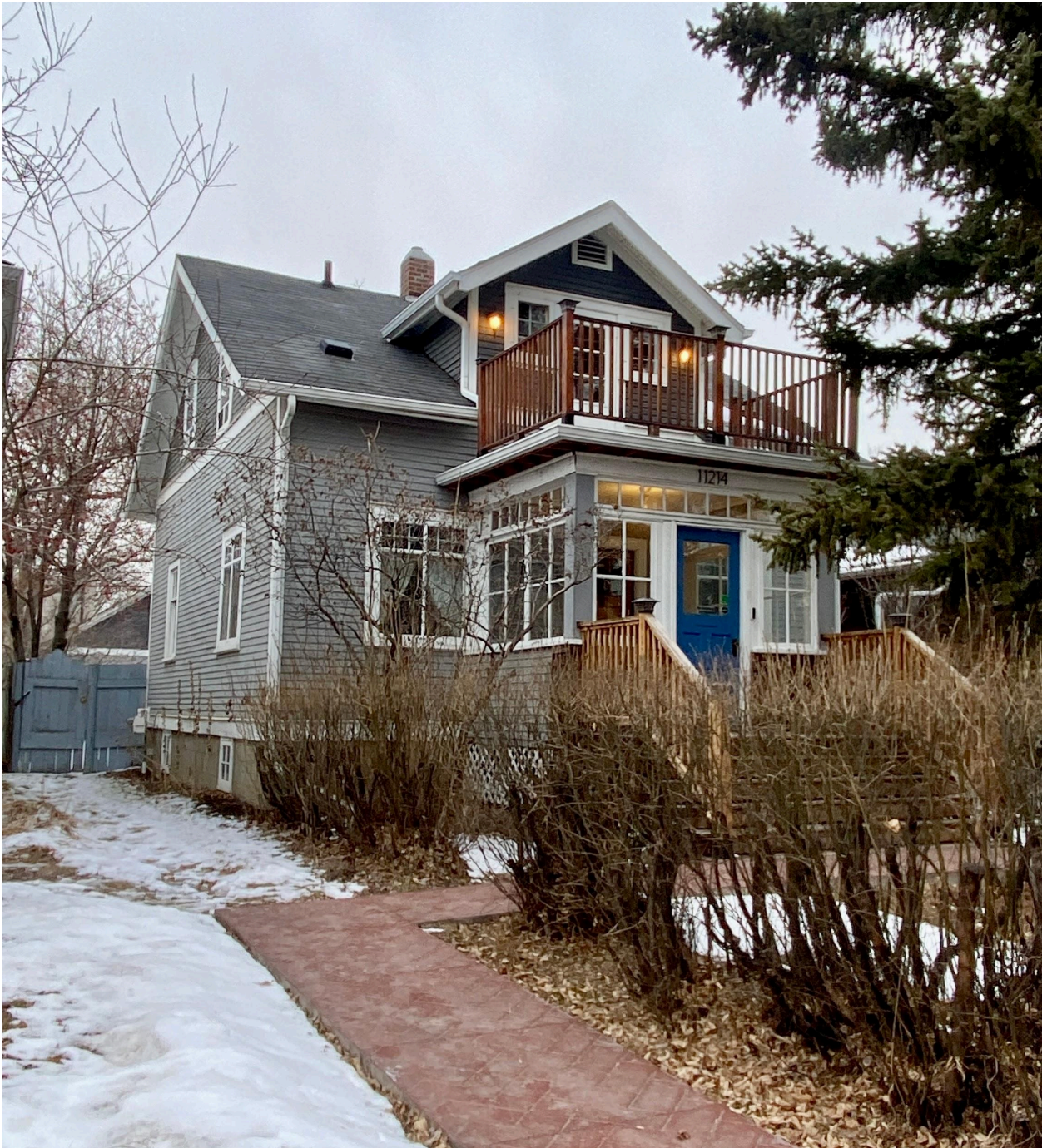
View of front (east) elevation of the Barker/Myren Residence.