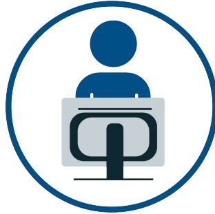
CITY WEBPAGE Jan 12, 2026