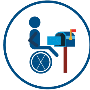
MAILED NOTICE Jan 29, 2026