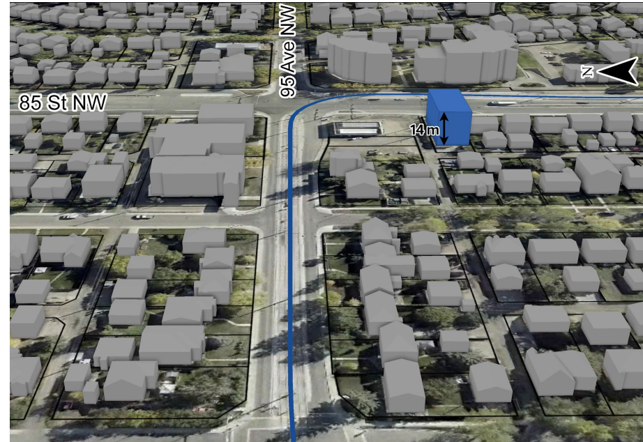
PROPOSED: RSM h14.0 Zone