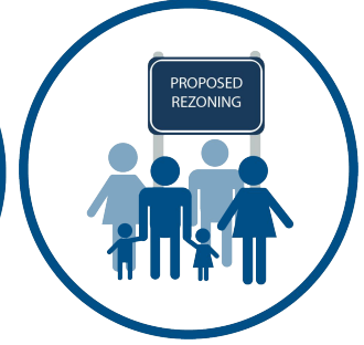
SITE SIGNAGE February 6, 2026