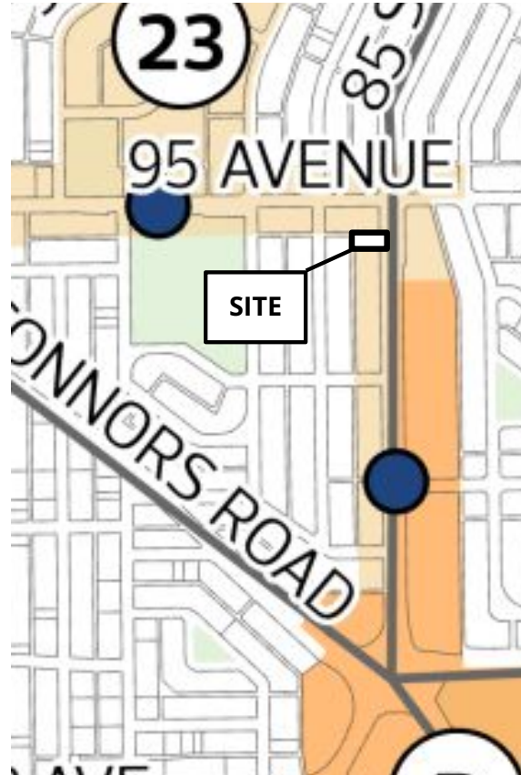
SOUTHEAST DISTRICT PLAN