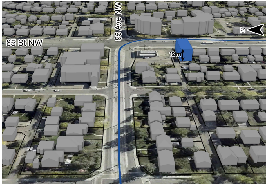
CURRENT: CN Zone