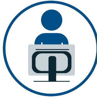
CITY WEBPAGE February 17, 2026