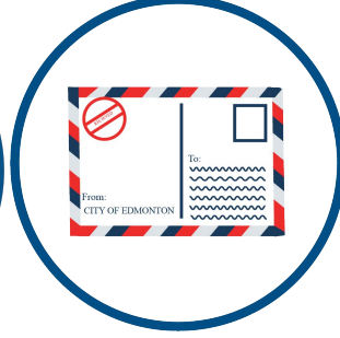
PUBLIC HEARING NOTICE April 7, 2026