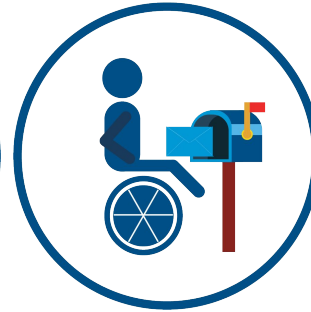
MAILED NOTICE February 5, 2026