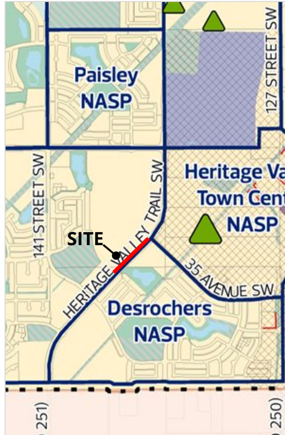
SOUTHWEST PLANNING DISTRICT