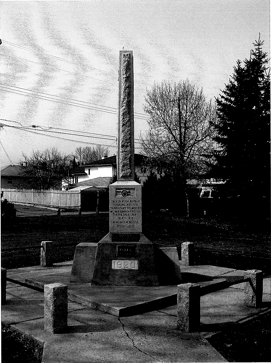
Front view of Beverly Heights Cenotaph