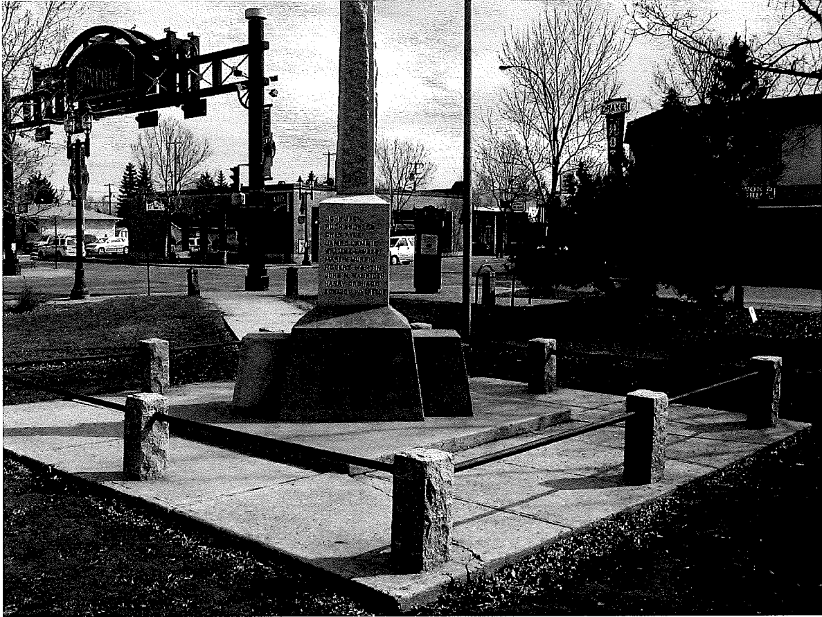
Rear view of Beverly Heights Cenotaph looking towards the intersection of 118 Avenue and 40 Street