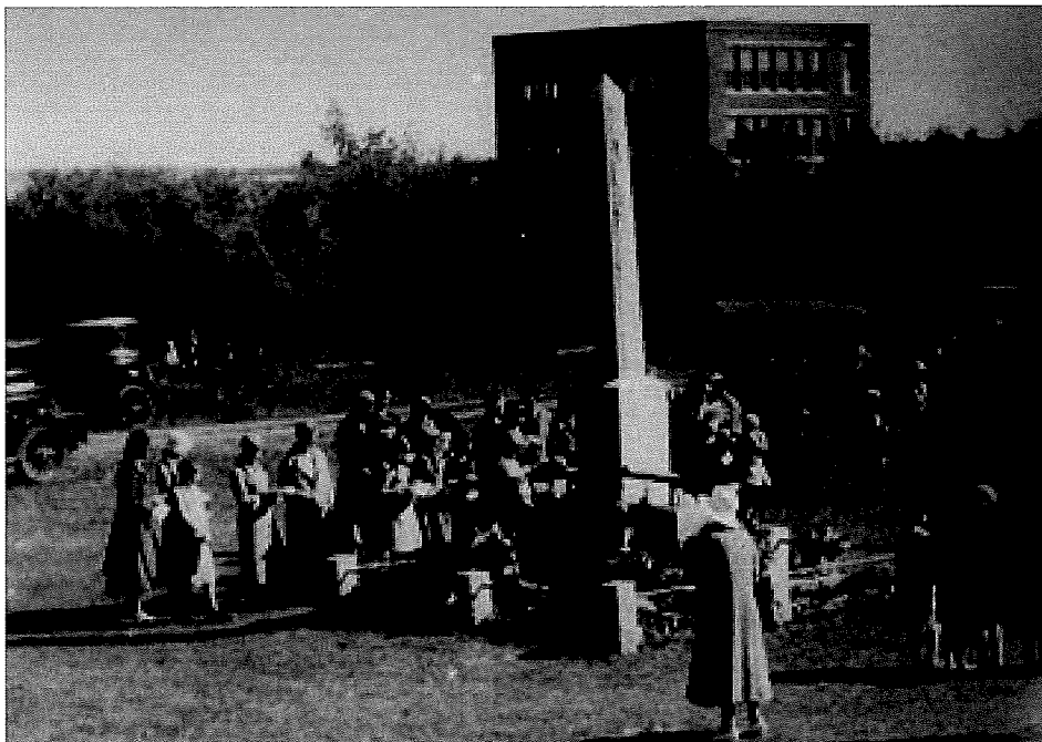
Historic 1933 image of Beverly Heights Cenotaph and Park