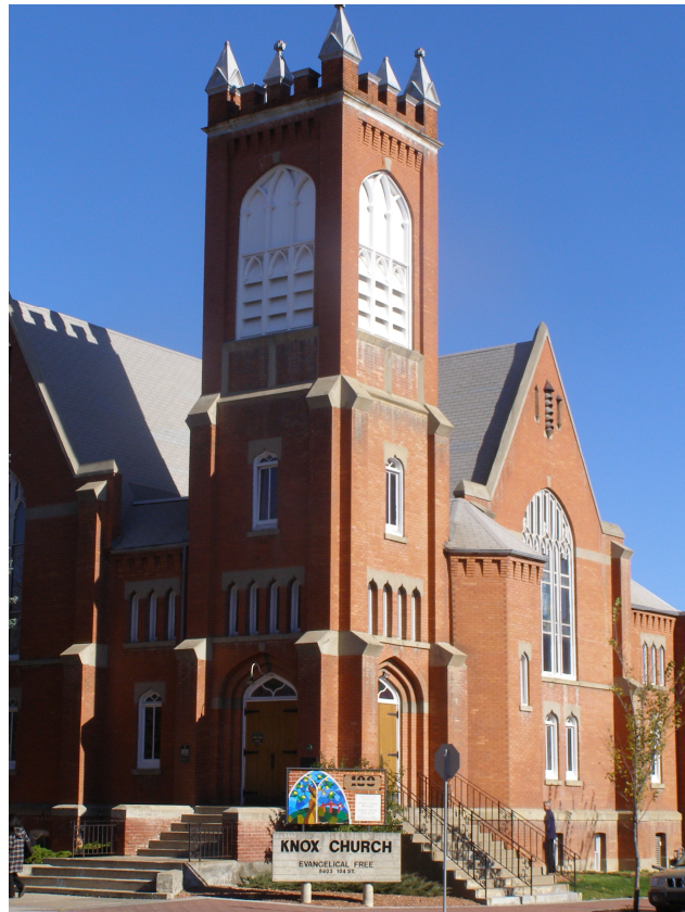
View of front entrance