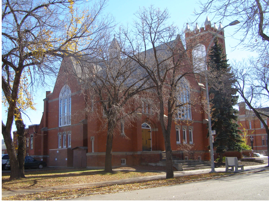
View of north and west elevations