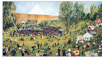
Symphony in the Park