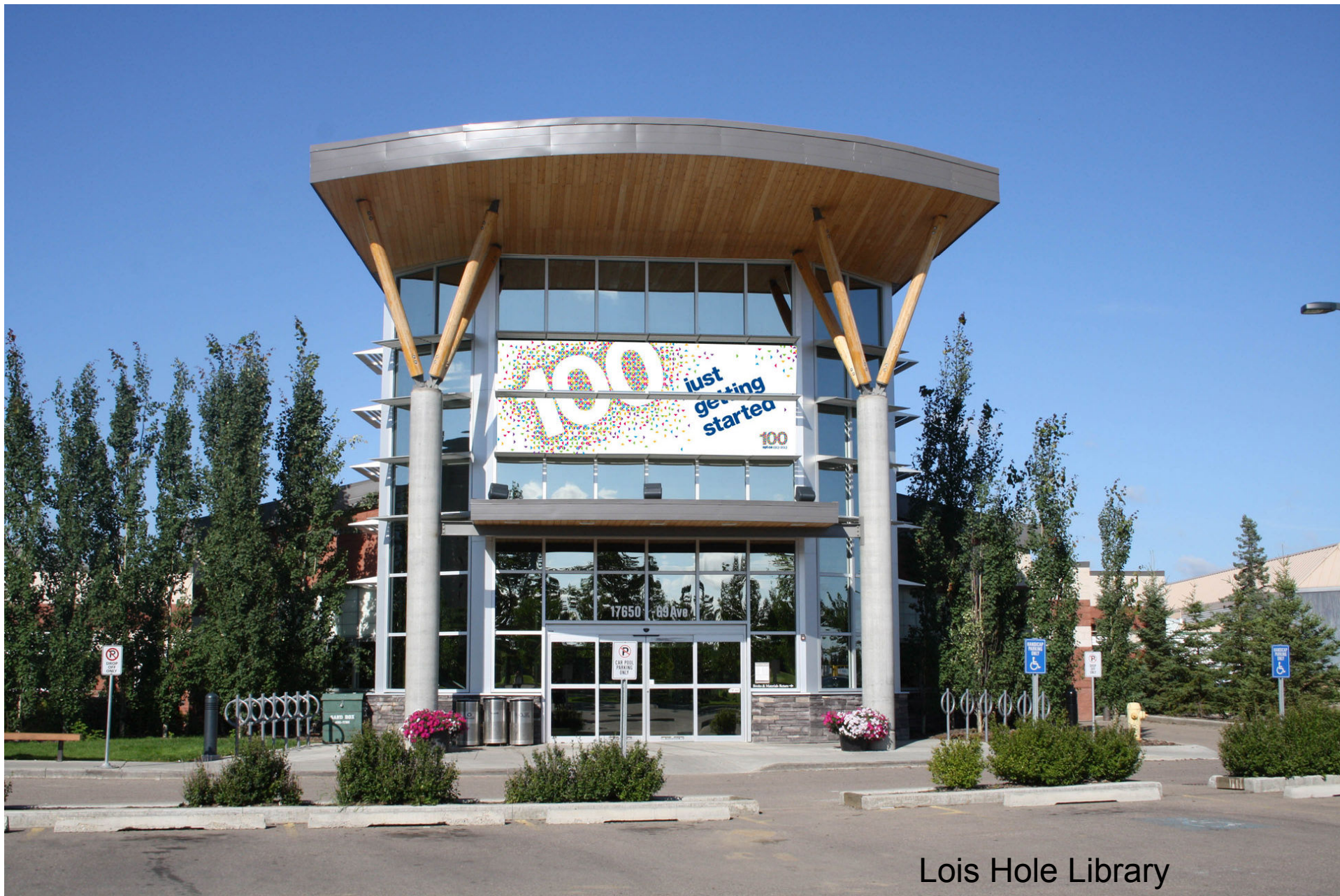
Lois Hole Library