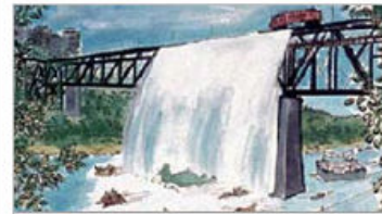
Waterfall Raft Race