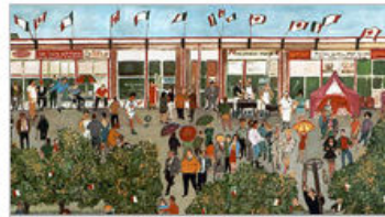
Giovanni Caboto Days