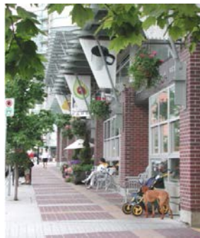
Figure 2 – Example of Commercial Retail Unit Active Frontage