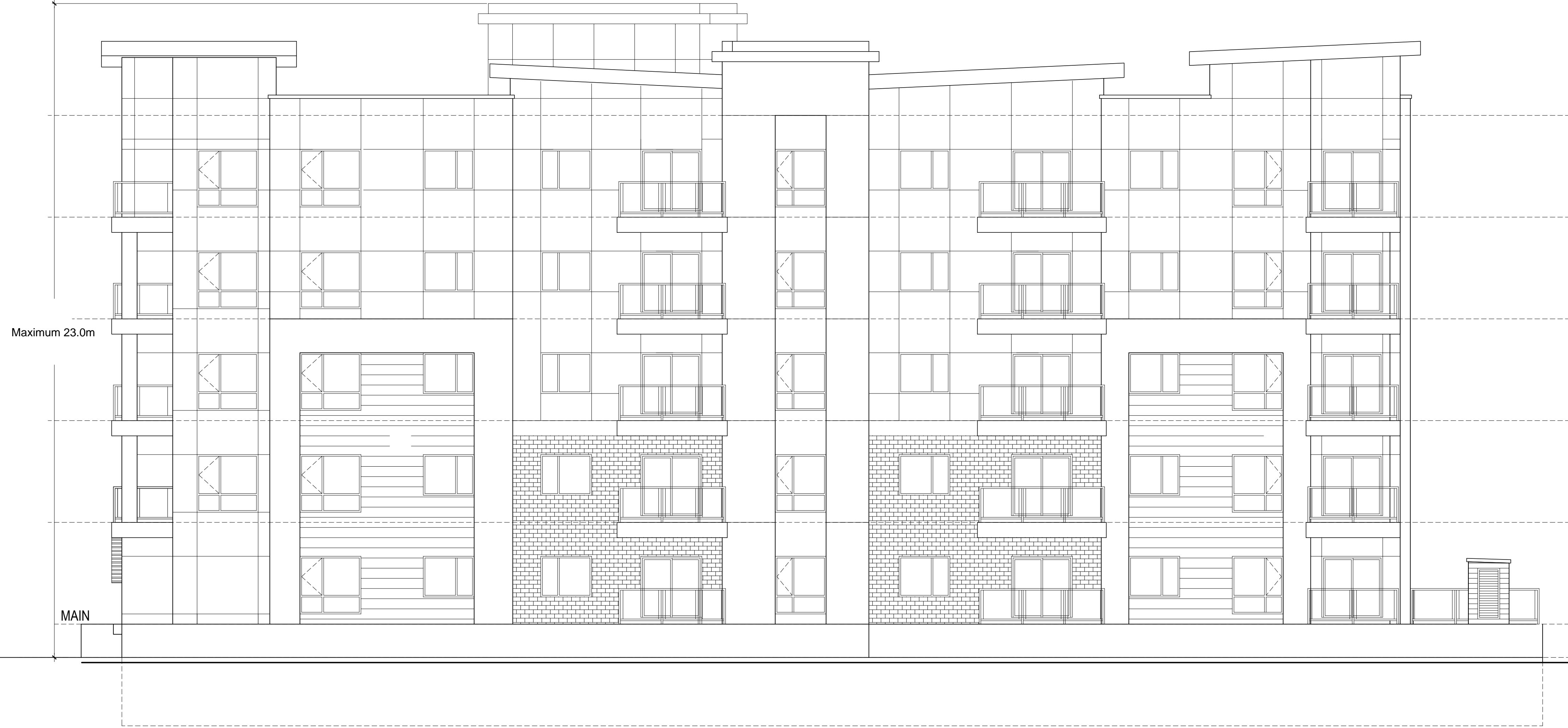
APPENDIX-4 WEST ELEVATION