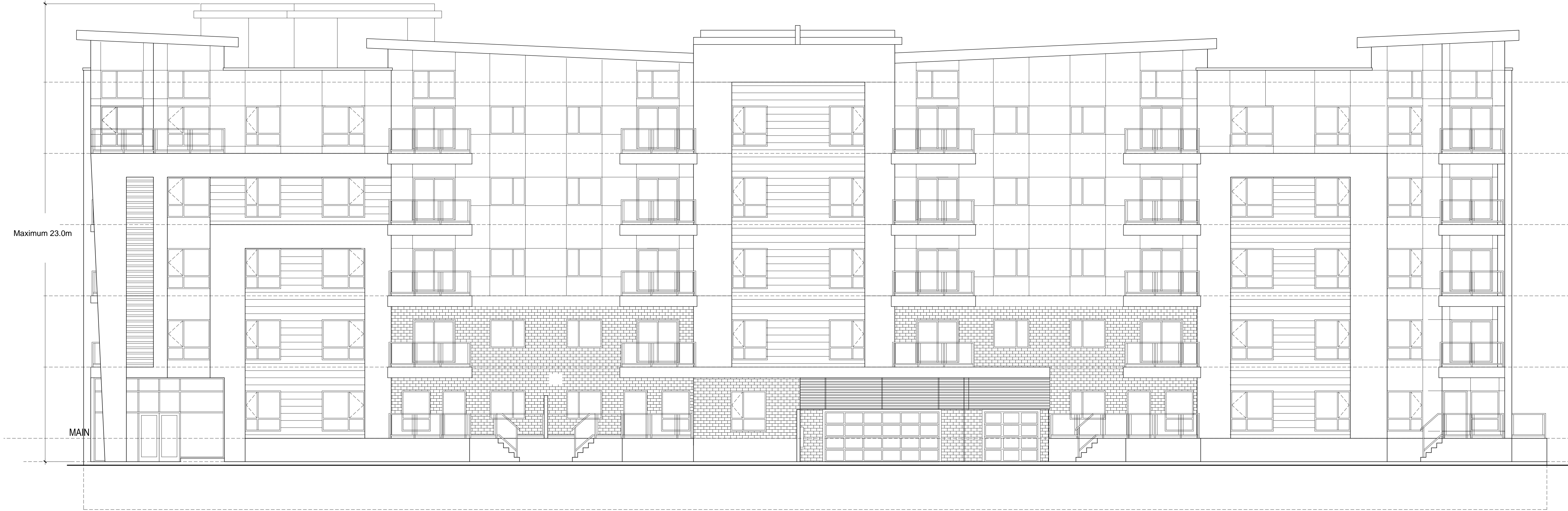
APPENDIX-2 NORTH ELEVATION