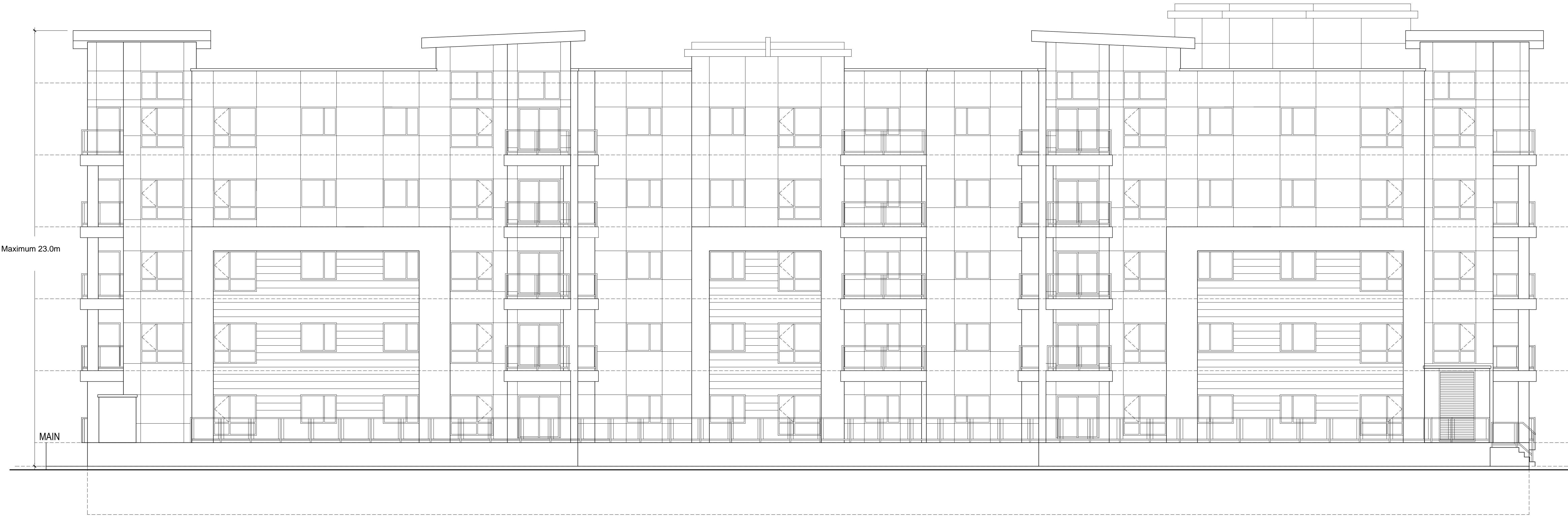
APPENDIX-3 SOUTH ELEVATION