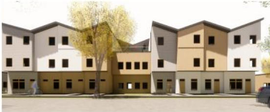
(Above Pictures) Proposed Development Concept