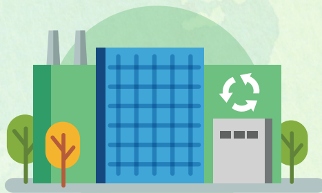
Eco Stations $2.22