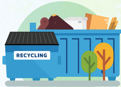
Drop Off $0.79