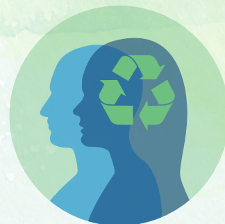
Waste Education Programs $0.99