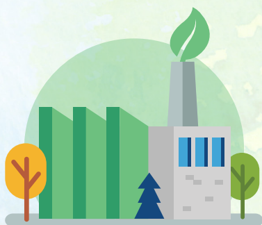
Refuse Derived Fuel Facility $2.56

What Residents Get for Their Monthly Rate