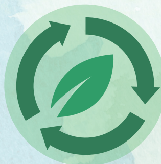
Organics Processing $10.43