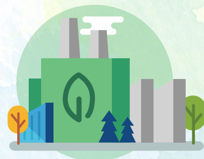
Materials Recovery Facility (MRF) $3.17