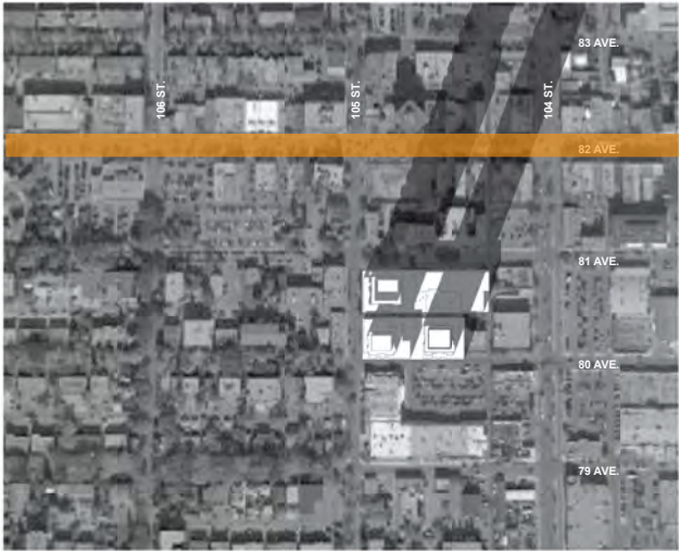
DECEMBER 21 - 15 PM