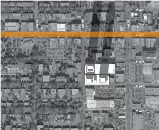
DECEMBER 21 - 14 PM