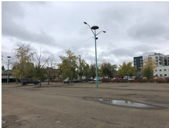
LOOKING NORTHWEST FROM WITHIN THE SITE