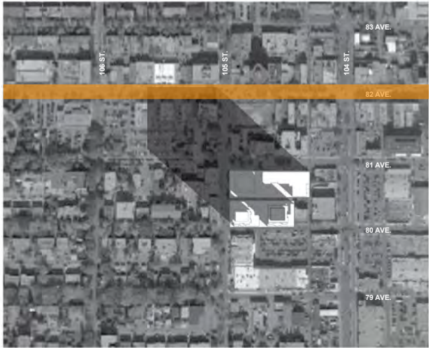
DECEMBER 21 - 9 AM