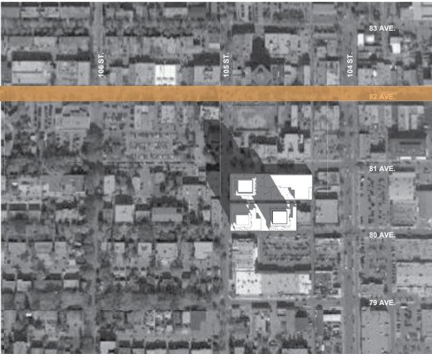
MARCH 21 - 12 PM