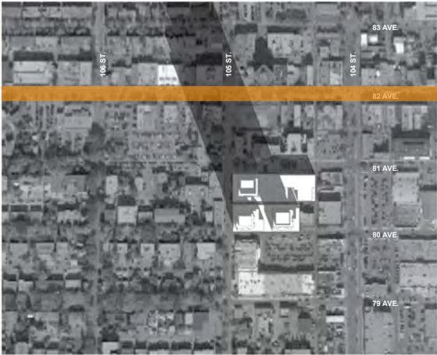
DECEMBER 21 - 12 PM