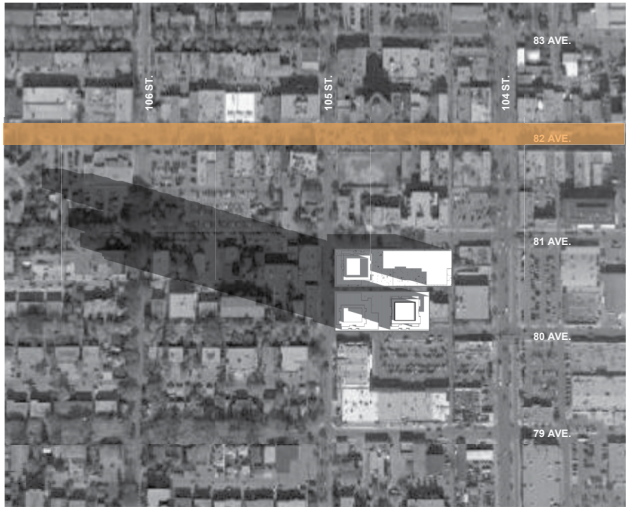
MARCH 21 - 9 AM