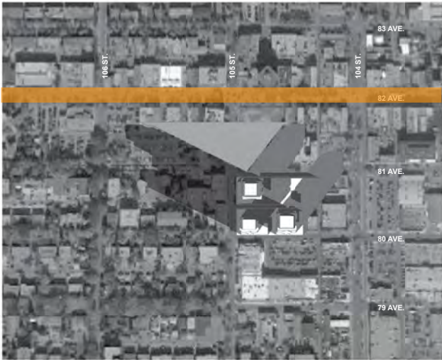
SEPTEMBER 21 - 9:34 TO 15:34 PM