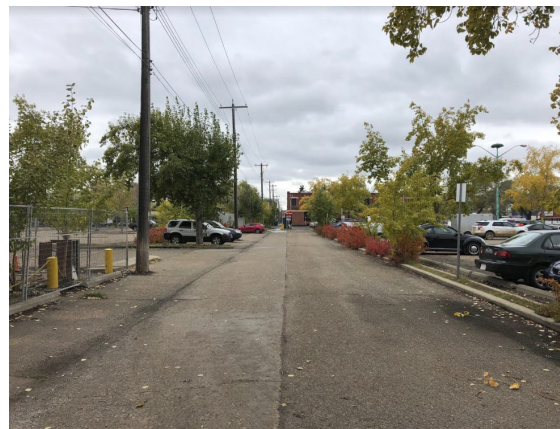
LOOKING WEST FROM WITHIN THE SITE, ALONG THE EXISTING LANE