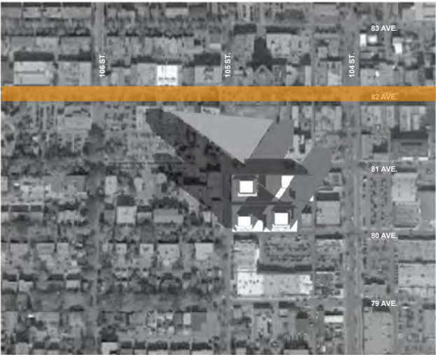
MARCH 21 - 9:34 AM TO 15:34 PM