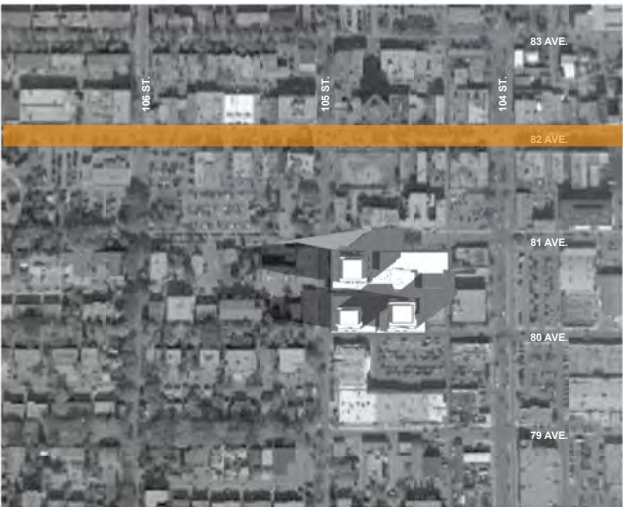
JUNE 21 - 9:34 AM TO 15:34 PM