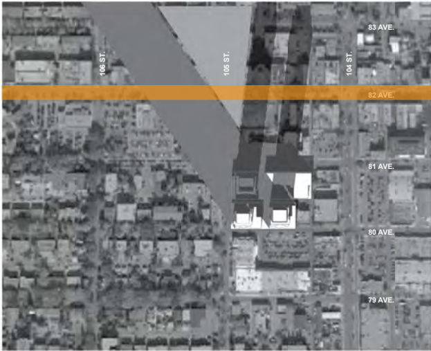
DECEMBER 21 - 11 AM TO 14 PM