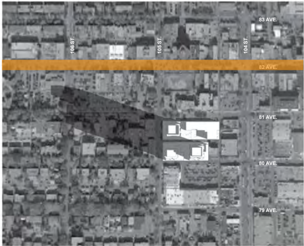
SEPTEMBER 21 - 9 AM