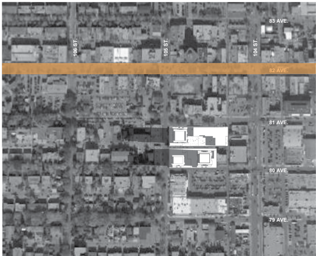
JUNE 21 - 9 AM