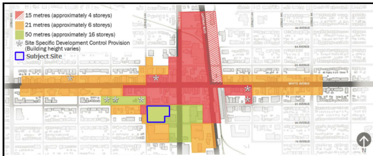
PLANWHYTE HEIGHT STRATEGY

One of the guiding principles of the study was ensuring that new development be appropriately located and scaled in an effort to maintain the existing character of the area, specifically the heritage commercial area of Whyte Avenue. As such, the study employs a height strategy which locates higher and more intense uses on the south side of Whyte Avenue. The subject site is identified within the study's "Urbanization District" which suggests heights of up to 50 metres (approximately 16 storeys).