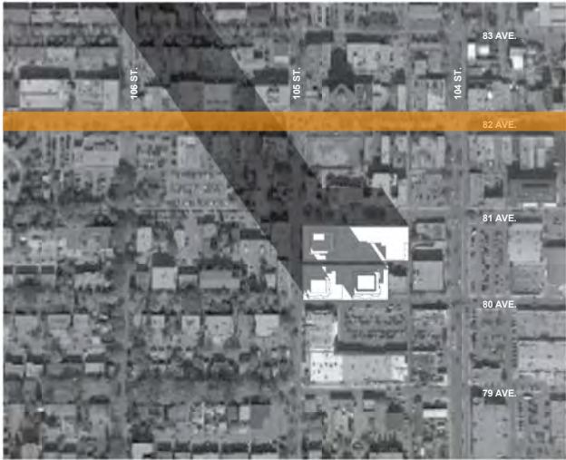
DECEMBER 21 - 11 AM