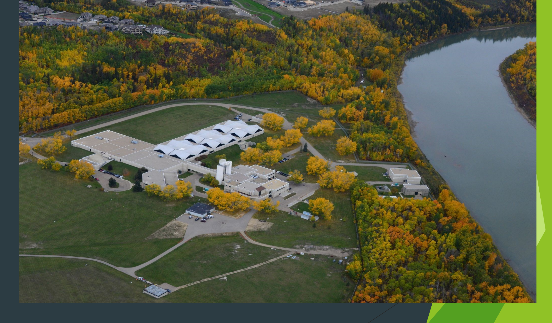
Epcor Water Treatment Plant (ca. 2019)