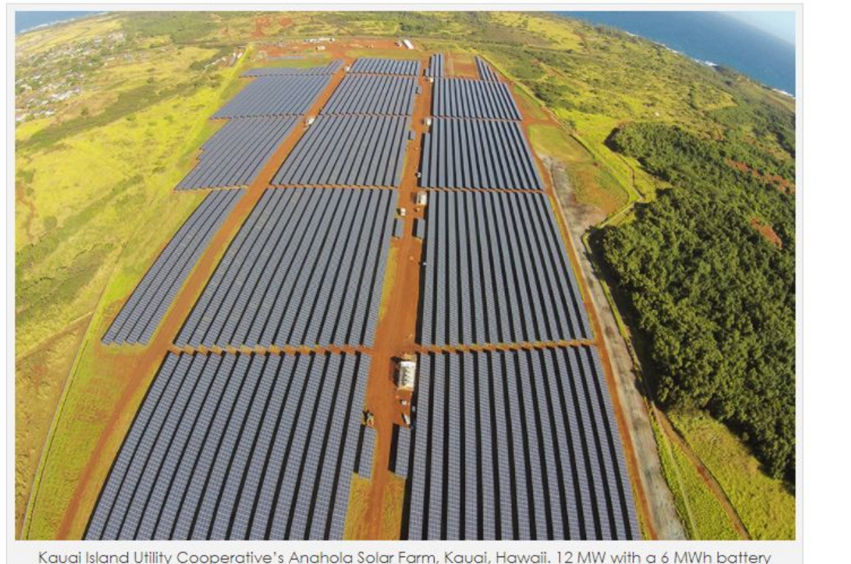
Kauai Island Utility Cooperative's Anahola Solar Farm, Kauai, Hawaii. 12 MW with a 6 MWh battery system. Scheduled to be operational in 2015. With this and other solar farms Kauai Island Utility Cooperative is proactive in reducing dependence on and costs of oil fired power plants. 12.5 cents/kWh (solar) versus 24 cents (oil).