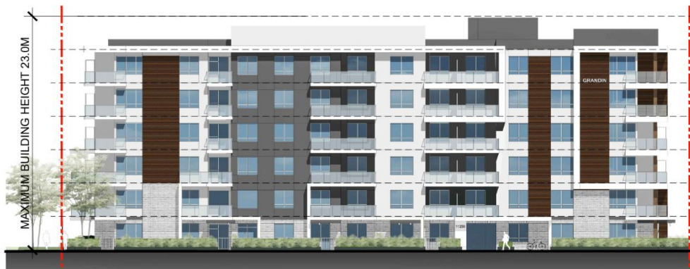
WEST ELEVATION - 113 Street