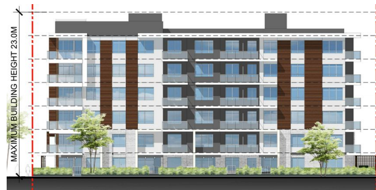
SOUTH ELEVATION - 100 Avenue