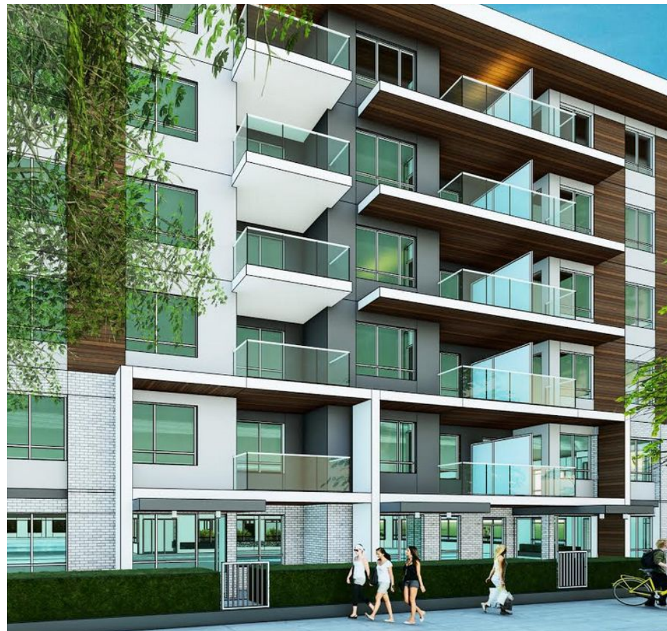
PROPOSED FACADE FRONTING 100 AVENUE