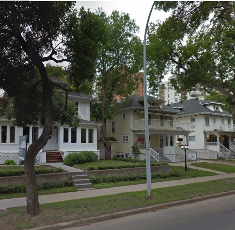
CHARACTER HOMES ON 100 AVENUE