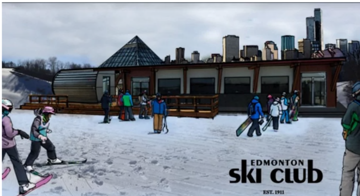
Figure B: Looking North at Warming Facility