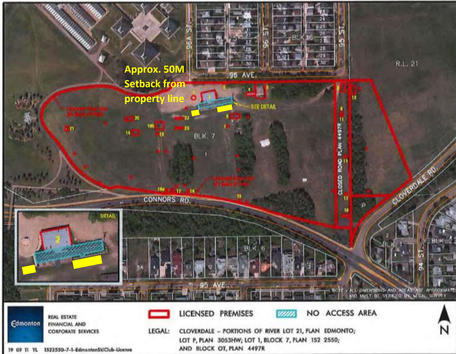
MAP OF LICENSED PREMISES