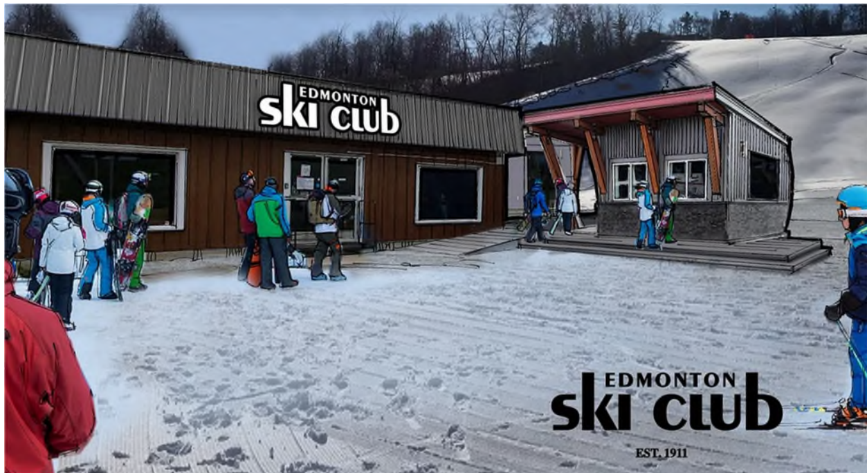
Figure A: Looking South at Outdoor Ticketing Window