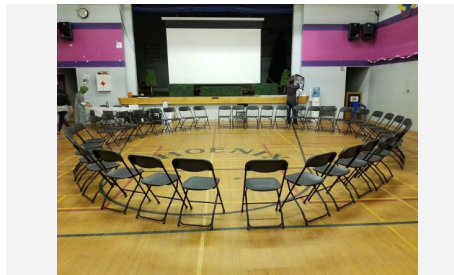
Connecting with Indigenous leaders and community members