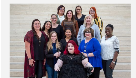
Supporting groups like AAC, ARAC, WAVE, Youth Council and the Task Force