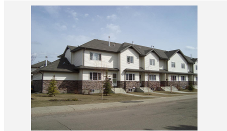
Working to secure spaces for affordable and permanent supportive housing.