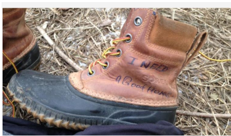
Supporting those sleeping rough in securing temporary or permanent housing.