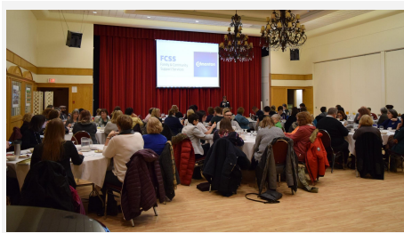
Connecting with local nonprofits