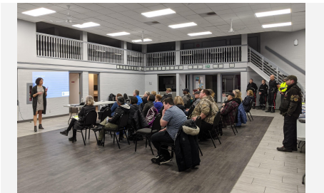
Responding to domestic violence calls and neighbourhood community safety