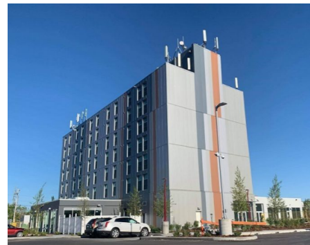
Post-Conversion (exterior) □