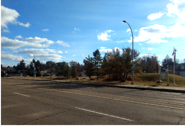
SUBJECT SITE (VIEW LOOKING SOUTHEAST FROM 82 AVENUE NW)