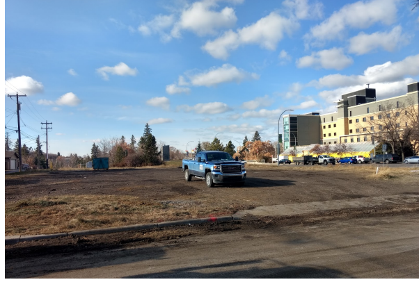
SUBJECT SITE (VIEW LOOKING WEST FROM 93 STREET NW)