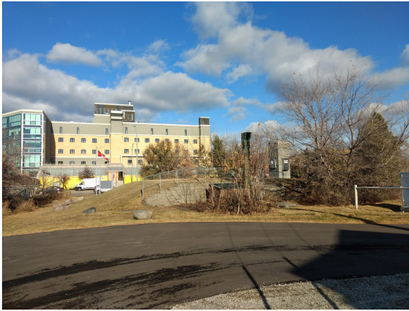
SUBJECT SITE - PU PORTION (VIEW LOOKING NORTH FROM ABUTTING LANE)