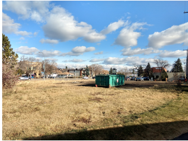
SUBJECT SITE - RA7 PORTION (VIEW LOOKING NORTHEAST FROM ABUTTING LANE)