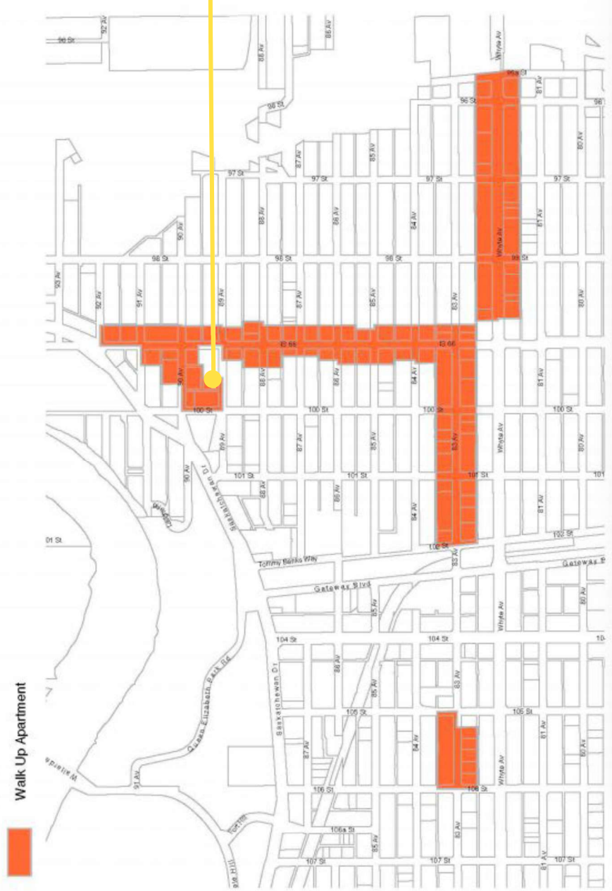
Figure 3 Walk Up Apartment Area