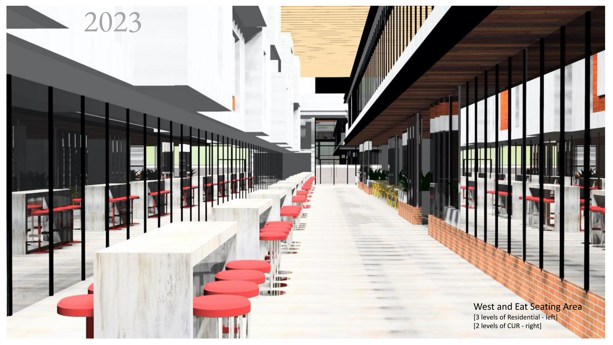
West and Eat Seating Area [3 levels of Residential - left] [2 levels of CUR - right]