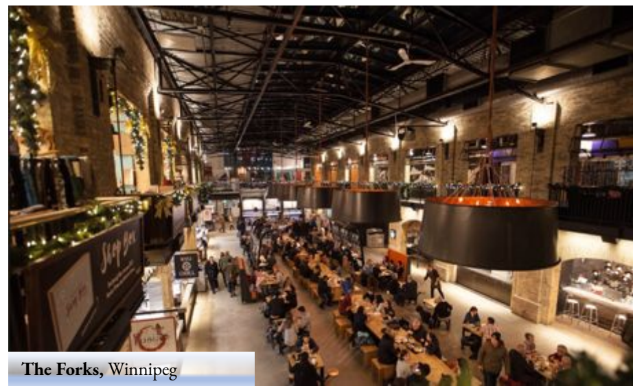
The Forks, Winnipeg