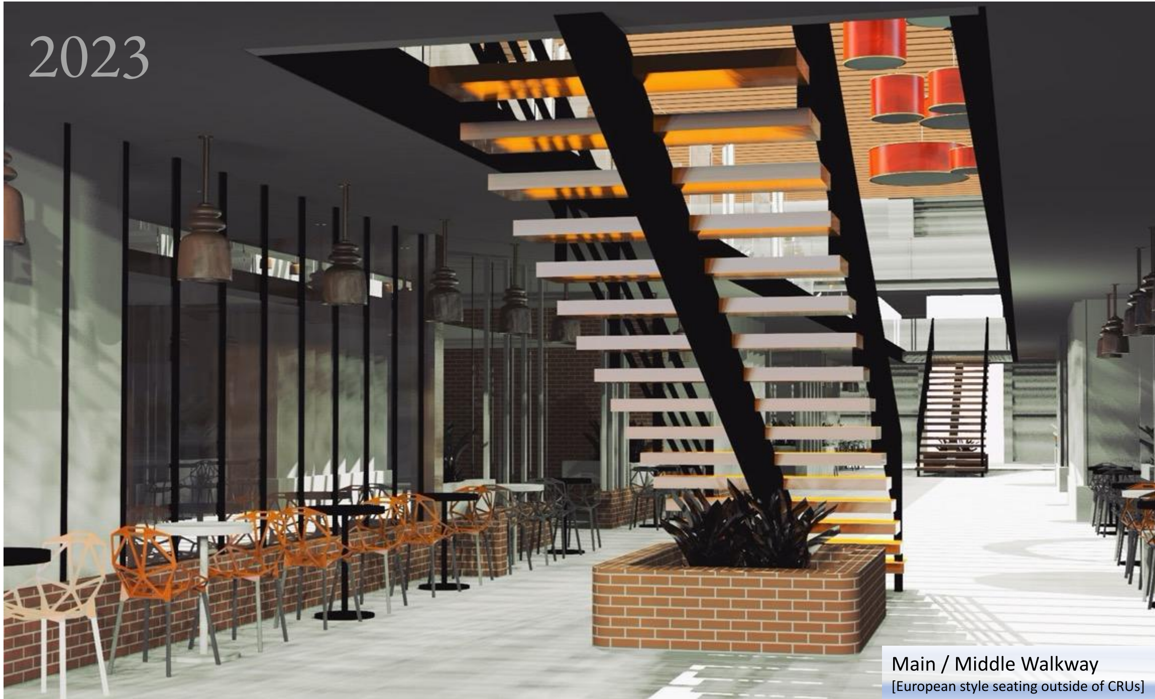
Main / Middle Walkway [European style seating outside of CRUs]