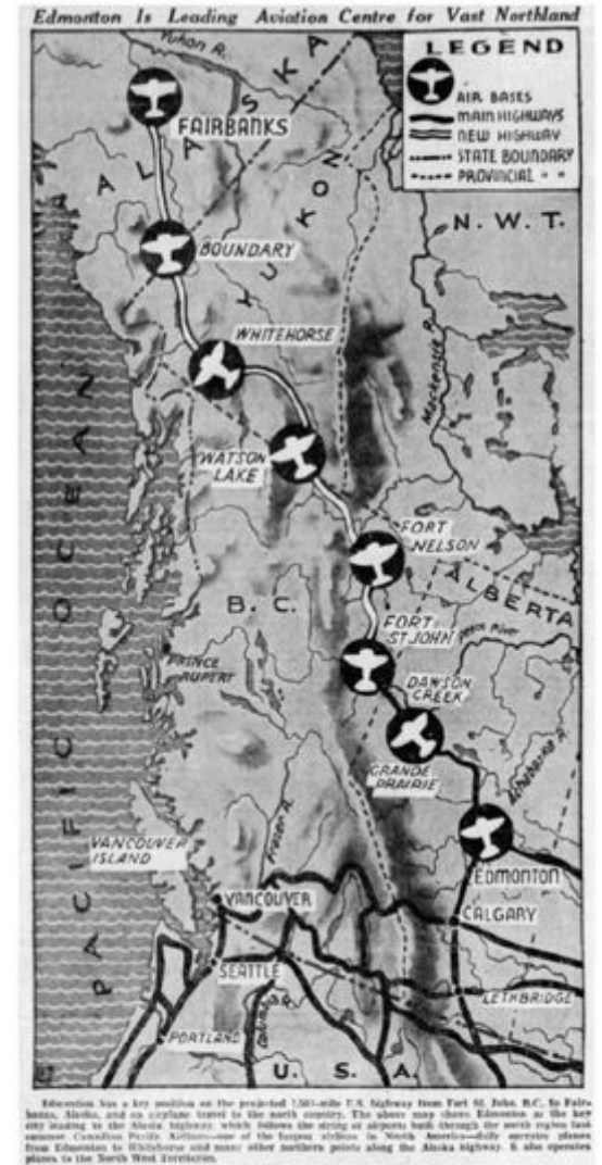
A map of the Northwest Staging Route published in the Edmonton Journal on October 20, 1942.

... Hangar 11 is believed to be one of the last remaining buildings of its kind in western Canada, possibly in the nation, and is one of the most significant historic structures in Edmonton. (p1)