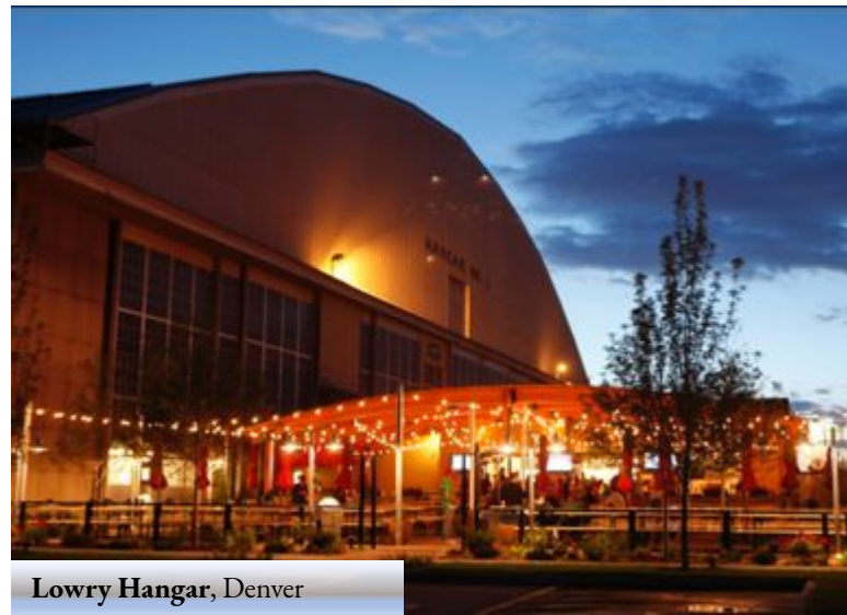
Lowry Hangar, Denver