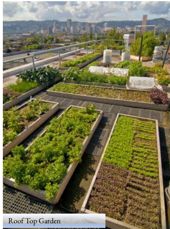
Roof Top Garden