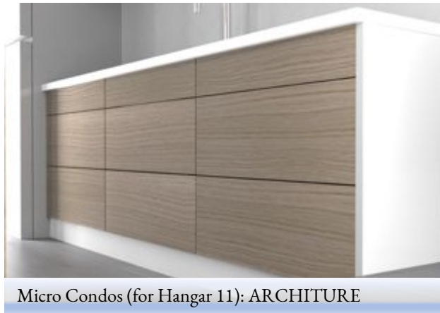
Micro Condos (for Hangar 11): ARCHITURE