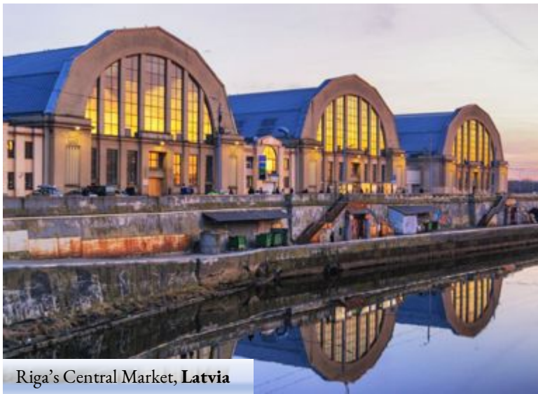
Riga's Central Market, Latvia