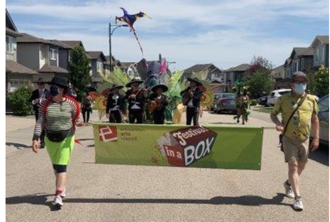
Terwillegar Festival in a Box Parade, 2020.