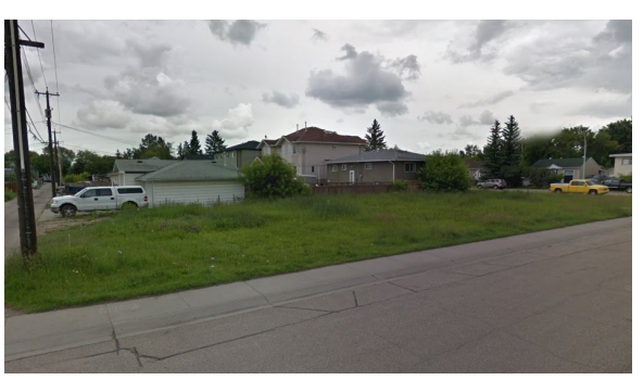
VIEW OF THE SITE LOOKING NORTHWEST