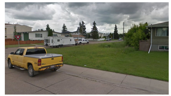
VIEW OF THE SITE LOOKING SOUTHWEST