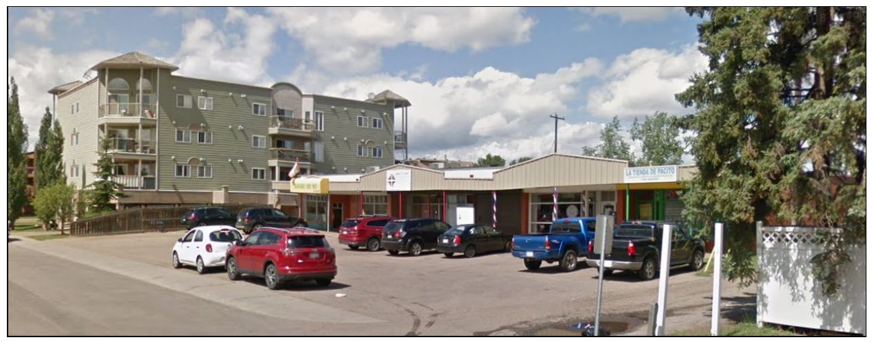
VIEW OF THE SITE AND EXISTING BUILDING FROM 112 AVENUE NW, LOOKING NORTHWEST