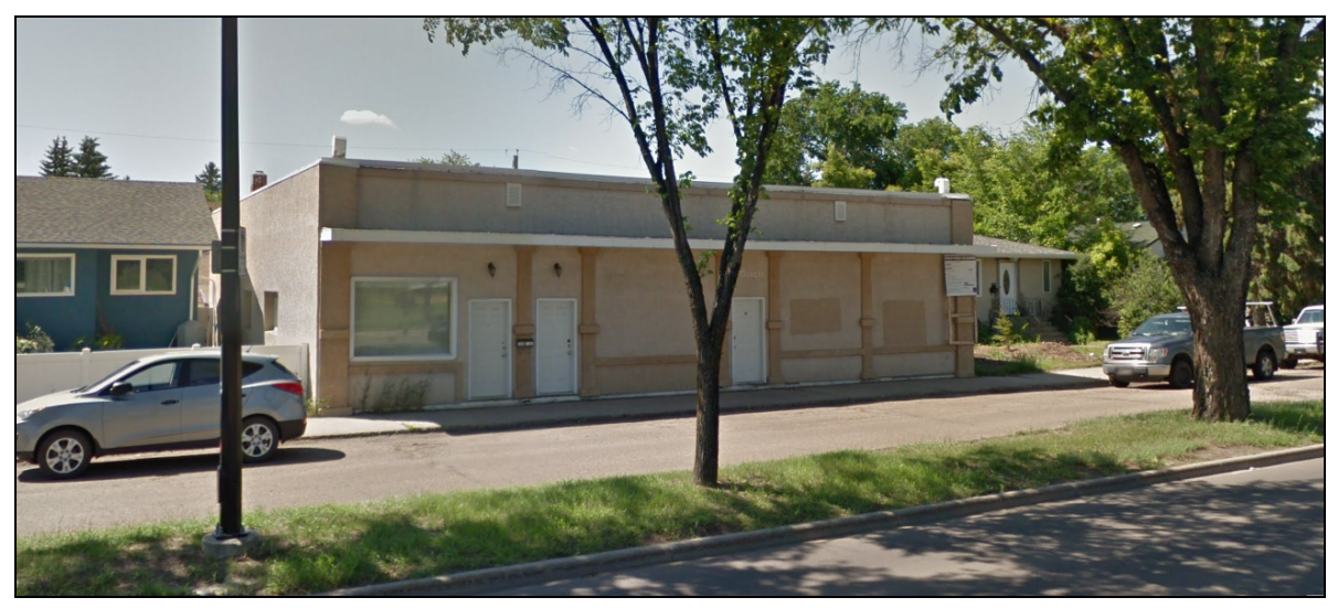
VIEW OF THE SITE FROM 112 AVENUE FROM THE NORTH EAST