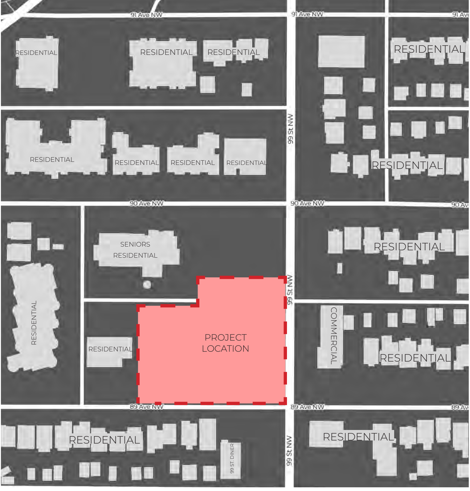
SITE AERIAL VIEW SITE CONTEXT MAP