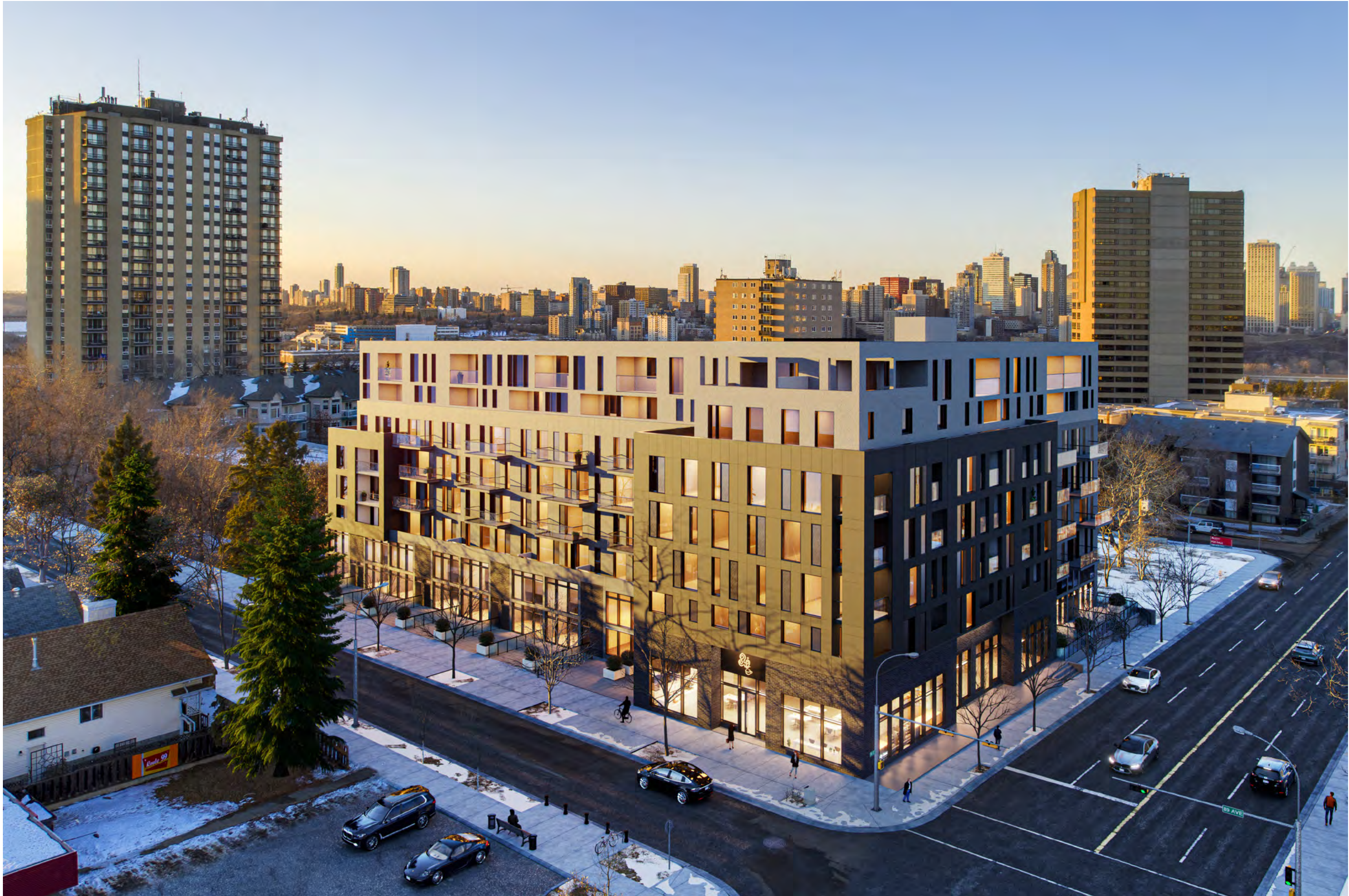
APPENDIX D- CONTEXTUAL VIEWS