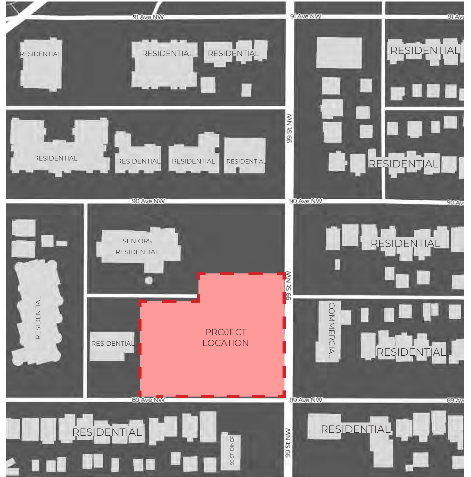
SITE CONTEXT MAP