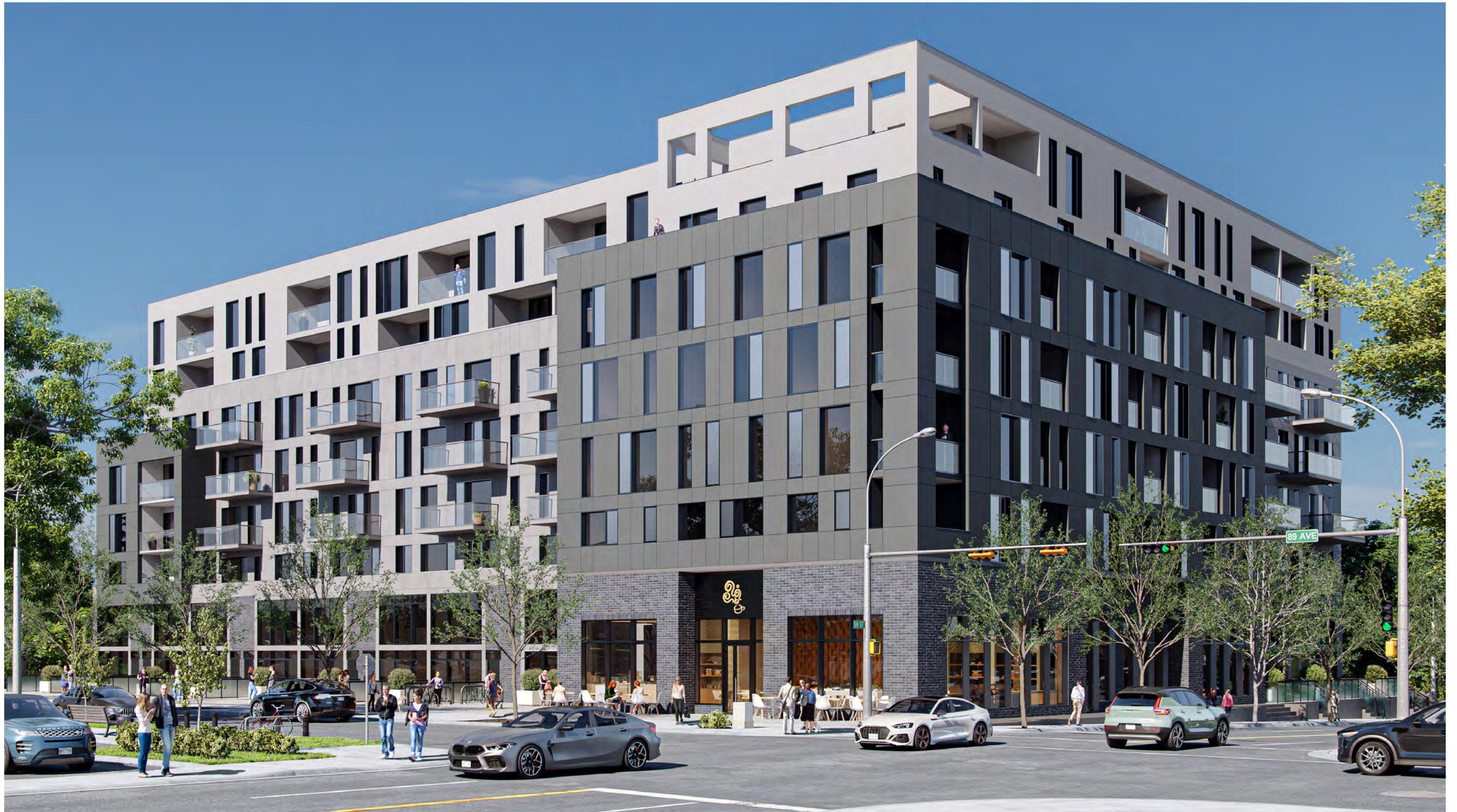
APPENDIX D- CONTEXTUAL VIEWS