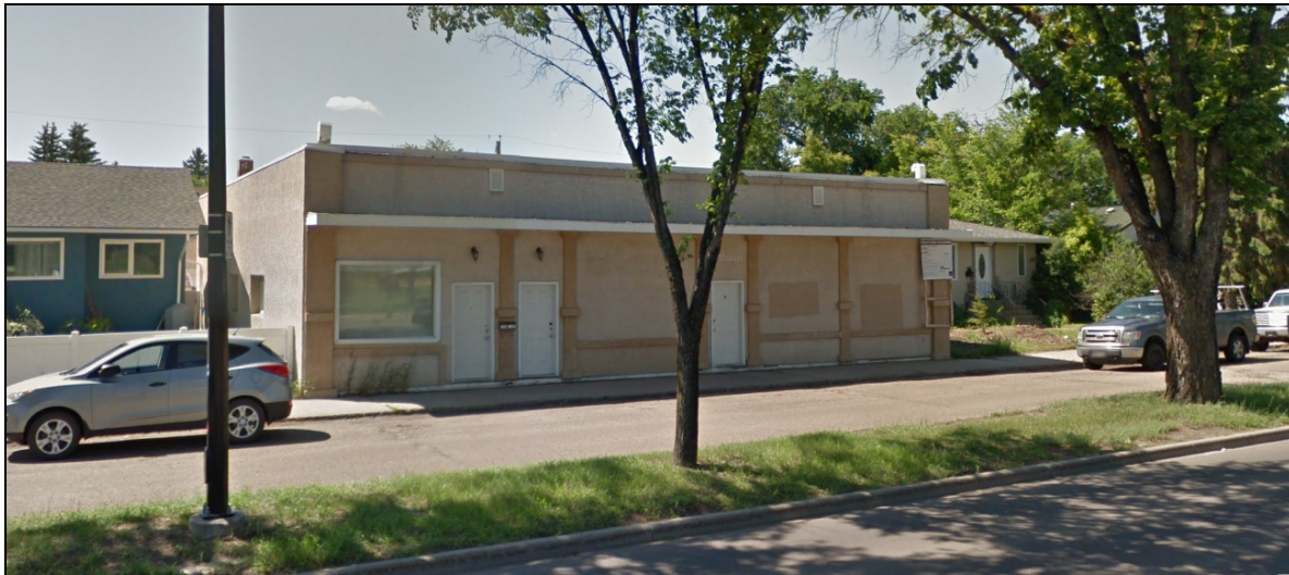
VIEW OF THE SITE FROM 112 AVENUE FROM THE NORTH EAST