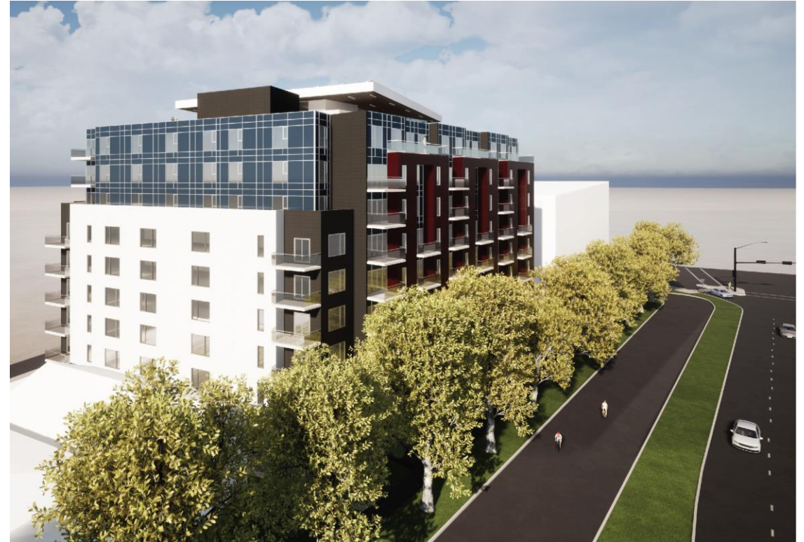
Design at Pre-Application Stage