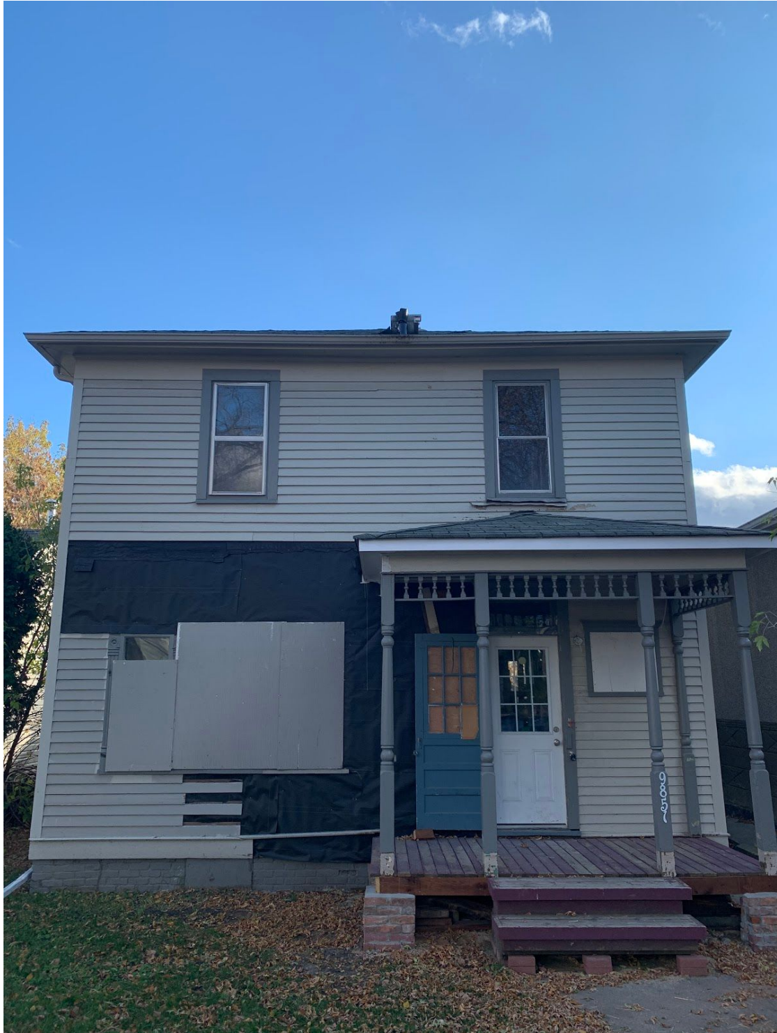
Front (North) Elevation