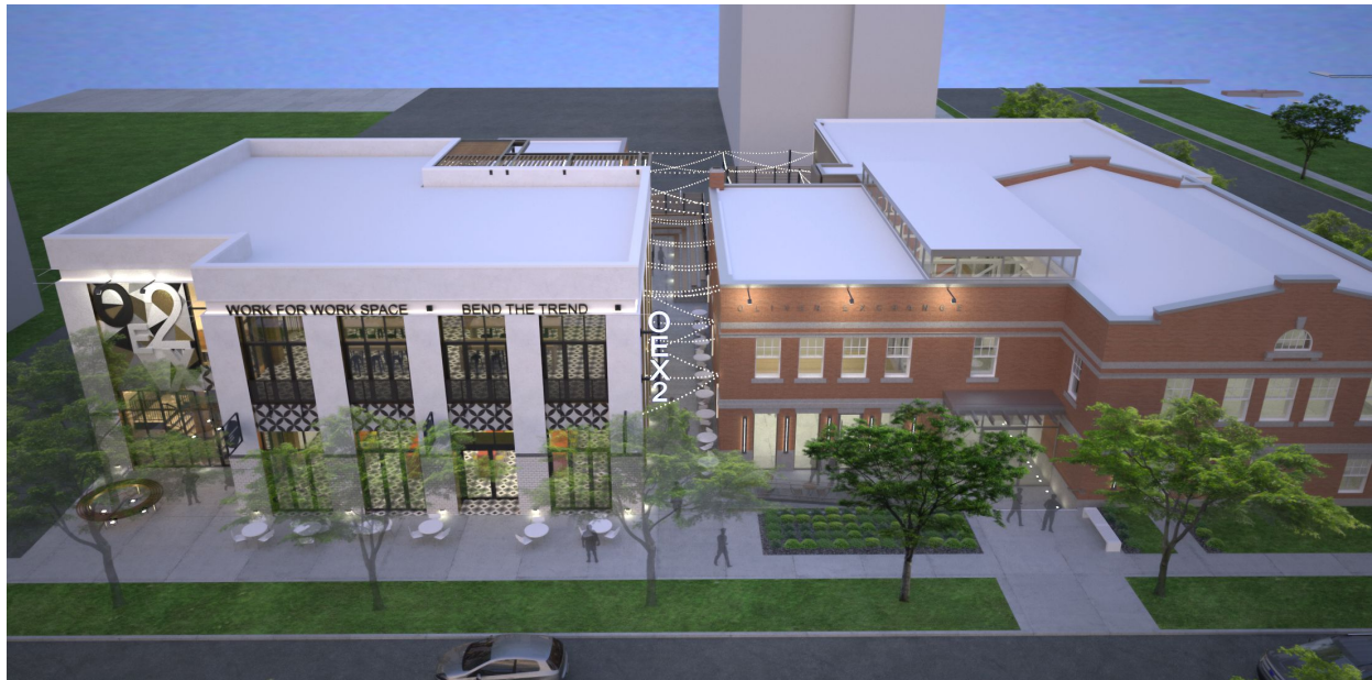
RENDERING LOOKING SOUTH

To allow for the development of a new commercial building, repurposing of an existing building and continued preservation of a historic building.