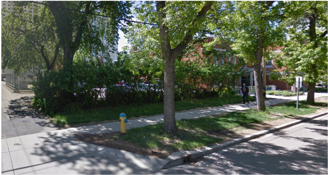
VIEW OF SITE FROM NORTHEAST