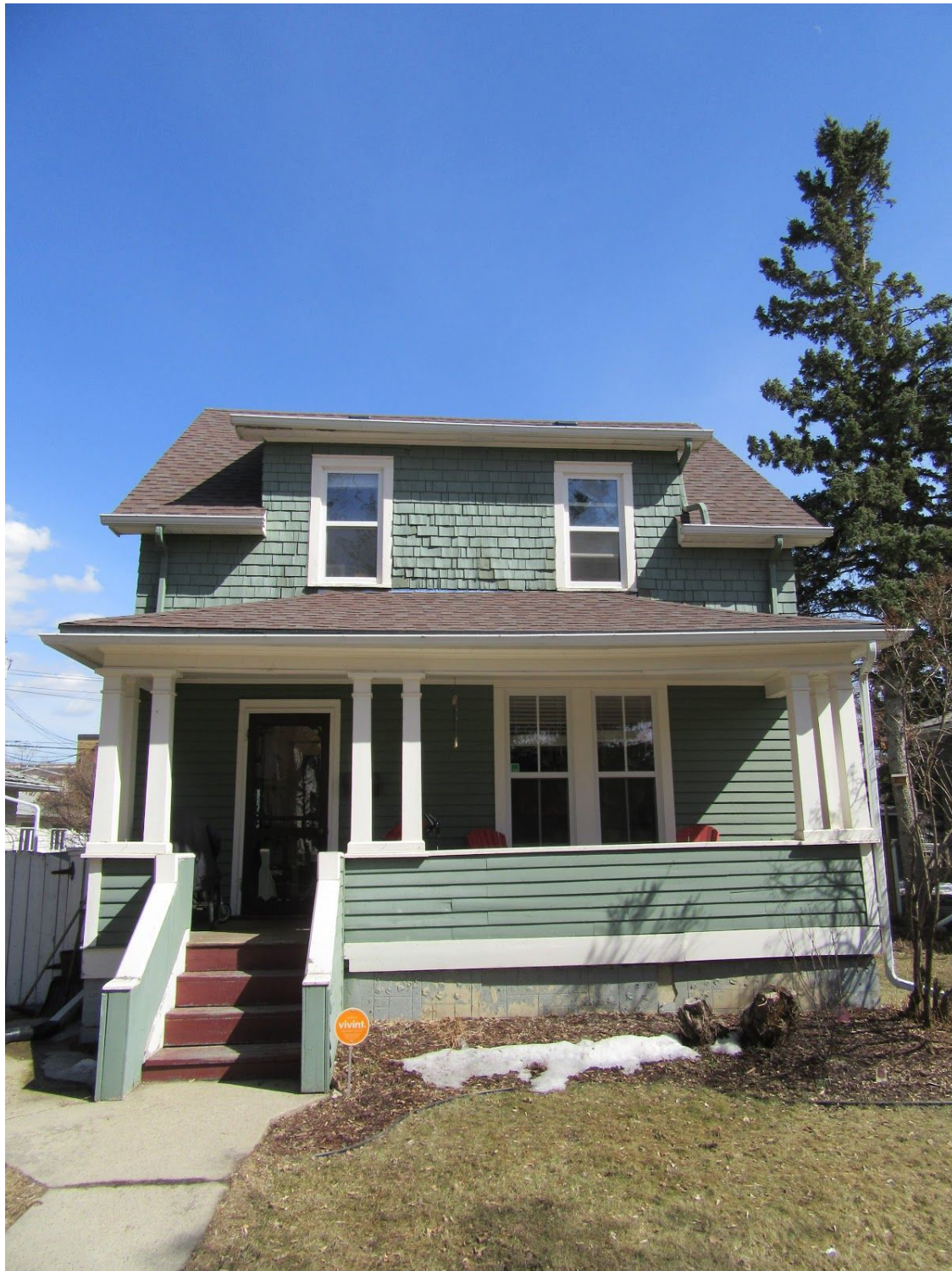
Front (West) Elevation