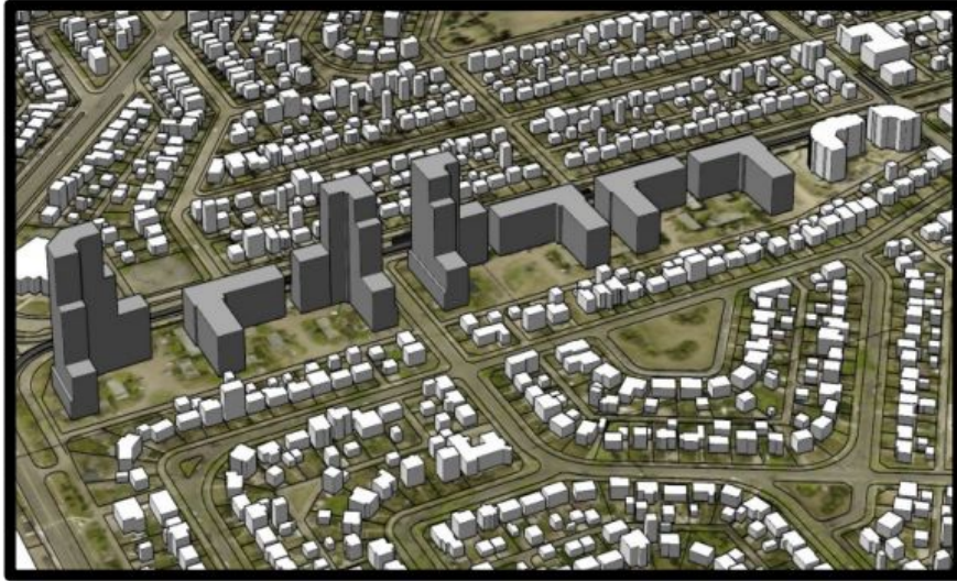
Aerial view from the site facing west