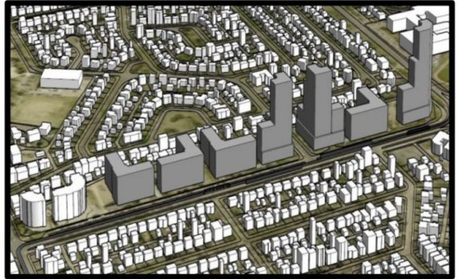
Aerial view from the site facing east